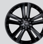
20" Kalimnos Gloss Black Alloy