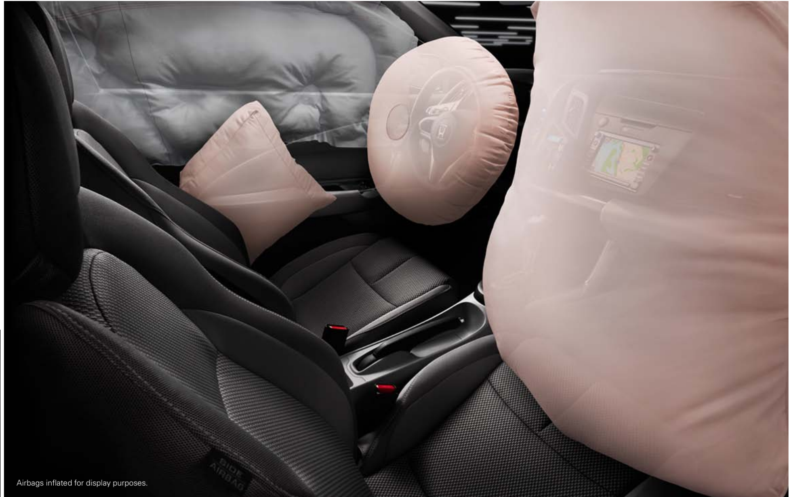
Airbags inflated for display purposes.

The CR-Z is equipped with 4-wheel disc brakes with anti-lock braking system (ABS) for impressive stopping power. The Brake Assist feature helps apply full braking in some emergency situations, and Electronic Brake Distribution (EBD) can distribute brake force among the four wheels based on how much load each wheel is bearing.