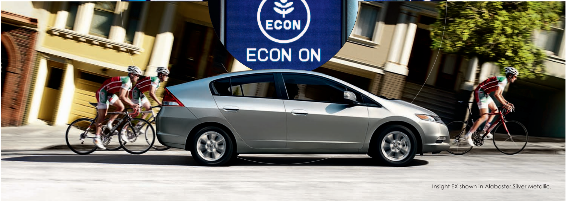
Insight EX shown in Alabaster Silver Metallic.

EPA numbers are important, but the way you drive also affects your fuel economy. 2 The Insight features the remarkable Eco Assist system that helps you monitor your driving habits, enabling you to make adjustments to your style that may help improve your efficiency.