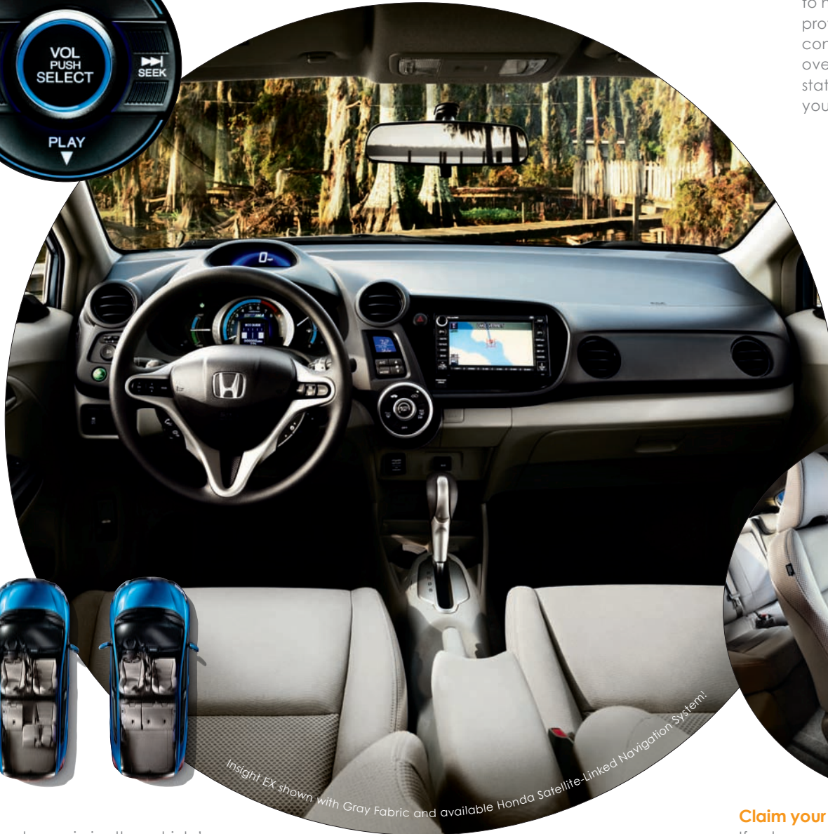
Insight EX shown with Gray Fabric and available Honda Satellite-Linked Navigation System†

*Honda reminds you to properly secure items stored in the cargo area.