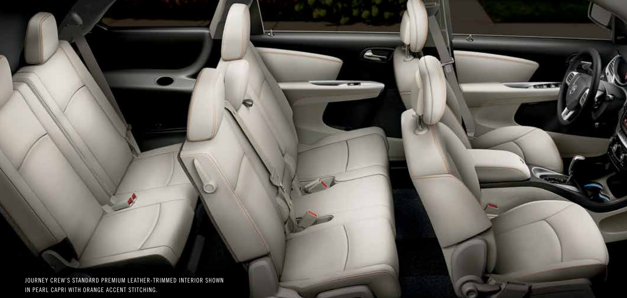
JOURNEY CREW'S STANDARD PREMIUM LEATHER-TRIMMED INTERIOR SHOWN IN PEARL CAPRI WITH ORANGE ACCENT STITCHING.

IT'S GOT GAME AND IT'S GAME FOR ANYTHING. The things you do and the places you go today won't be the same tomorrow. To accommodate, Journey's interior easily transforms from people-mover to cargo-hauler. With flexible five- or seven-passenger seating, second-row reclining 60/40 split-folding seatbacks and inventive storage everywhere, Journey is at the ready. Because getting there should be half the fun, this interior indulges with stadium seating, Dual-Zone Temperature Control and soft-touch surfaces. Seats feature either premium cloth or available leather trim with striking accent stitching. Upscale Satin Silver accents lend a premium touch. Third-row access is easy, thanks to 90-degree rear-door openings and available Tilt 'n Slide™ second-row seats. PARTY IN THE BACK. Traveling without entertainment isn't an option. The center floor console features 12-volt power outlets, remote USB port, auxiliary audio input and out-of-view storage. The available 115-volt/150-watt two-prong outlet powers portable game devices or audio hookups. Second- and third-row passengers will enjoy the available Rear DVD Entertainment System that features a nine-inch screen, premium speakers, two sets of wireless headphones and a remote control.