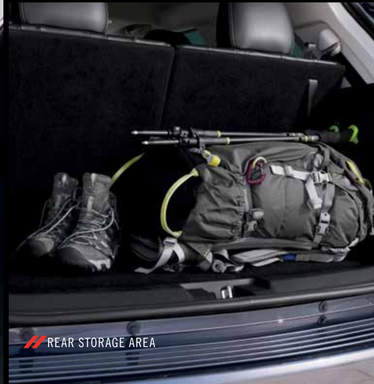
// REAR STORAGE AREA