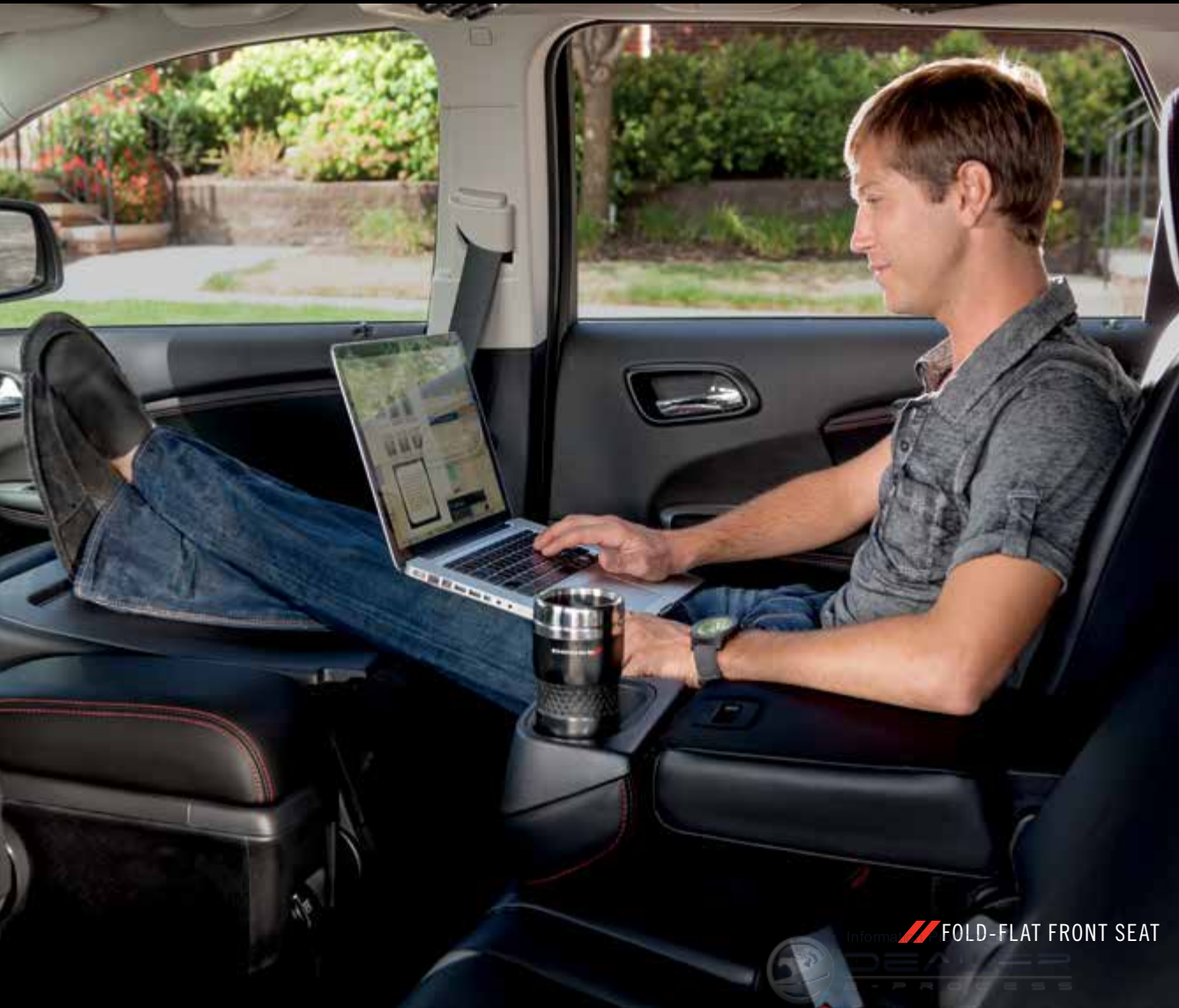
Informa // FOLD-FLAT FRONT SEAT