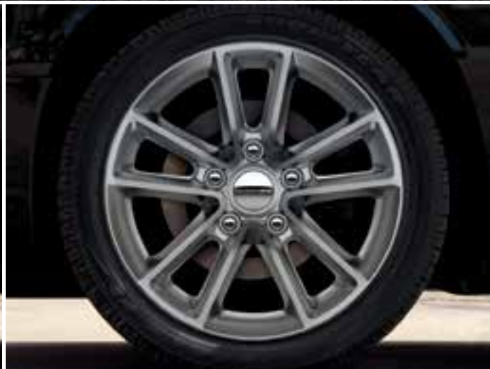
17-inch polished aluminum with Satin Carbon pockets (standard on SXT 30 th Anniversary Edition)