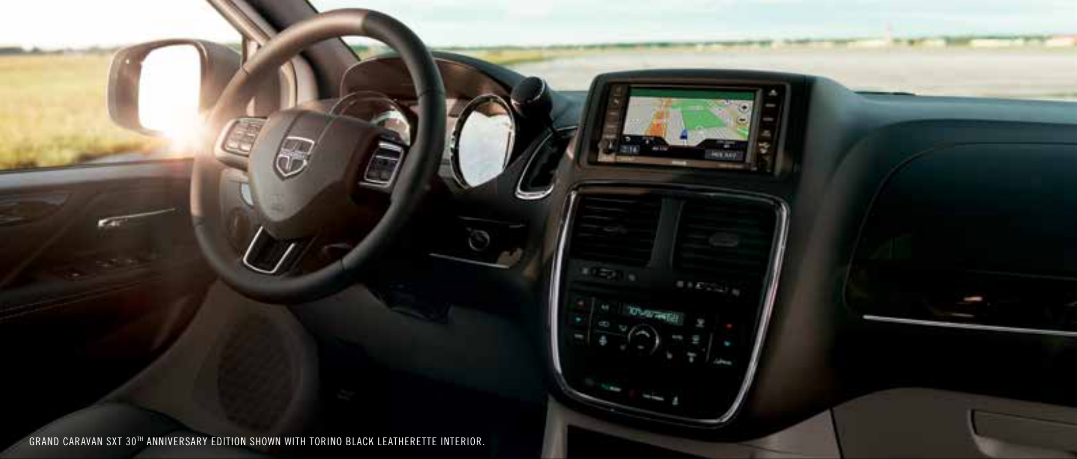
GRAND CARAVAN SXT 30 TH ANNIVERSARY EDITION SHOWN WITH TORINO BLACK LEATHERETTE INTERIOR.

INTUITIVE, DRIVER-FRIENDLY TECHNOLOGY. It starts with the standard Uconnect ® 130 radio/CD player with auxiliary jack and builds up to the available Uconnect 430N system with 6.5-inch touch screen and Garmin ® Navigation that lets you launch a playlist from your MP3 player, request directions and make a call, all without taking your hands off the wheel. From the simple to the fully advanced, Grand Caravan and Uconnect offer technology that keeps you connected.