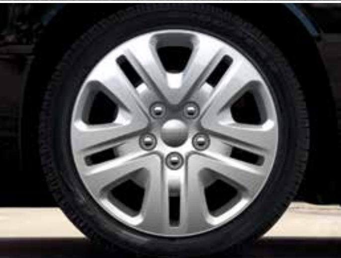
17-inch wheel cover (standard on AVP and SE)