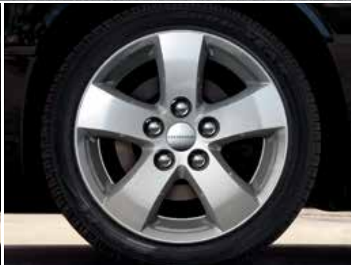
17-inch aluminum (optional on SE)