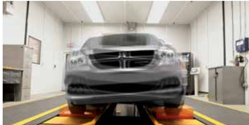
FOUR-POST SHAKER — SUSPENSION TESTING