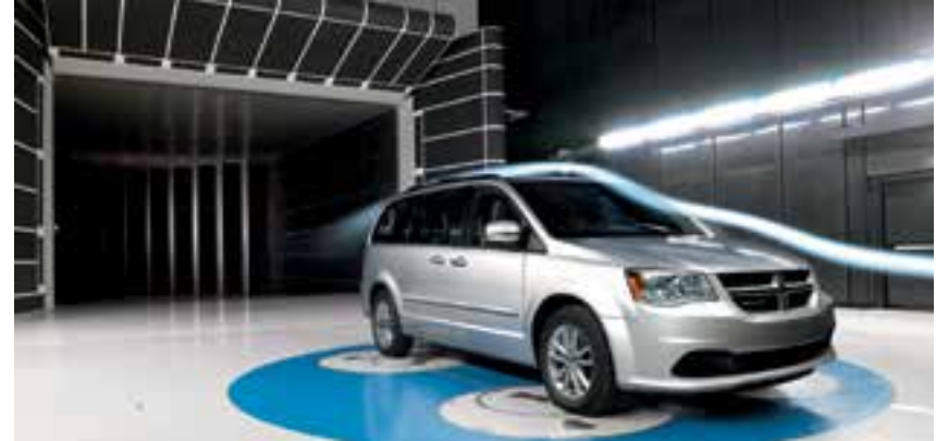
WIND TUNNEL TESTING