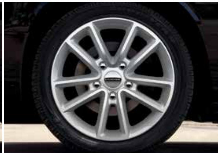
17-inch Tech Silver aluminum (standard on SXT)