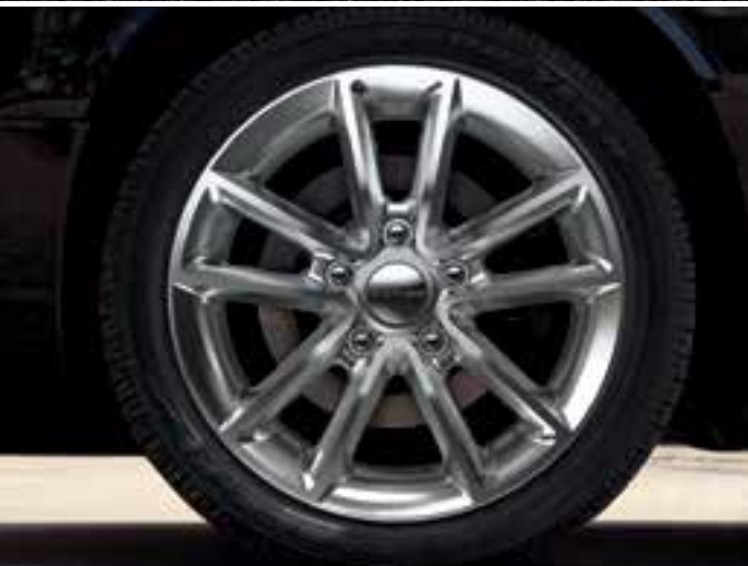
17-inch Satin Carbon aluminum (standard on SE 30 th Anniversary Edition* and R/T)