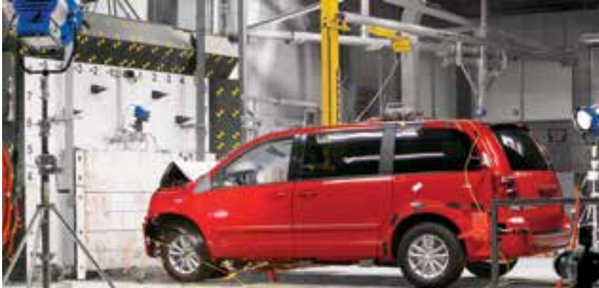
CRUSH ZONE TESTING