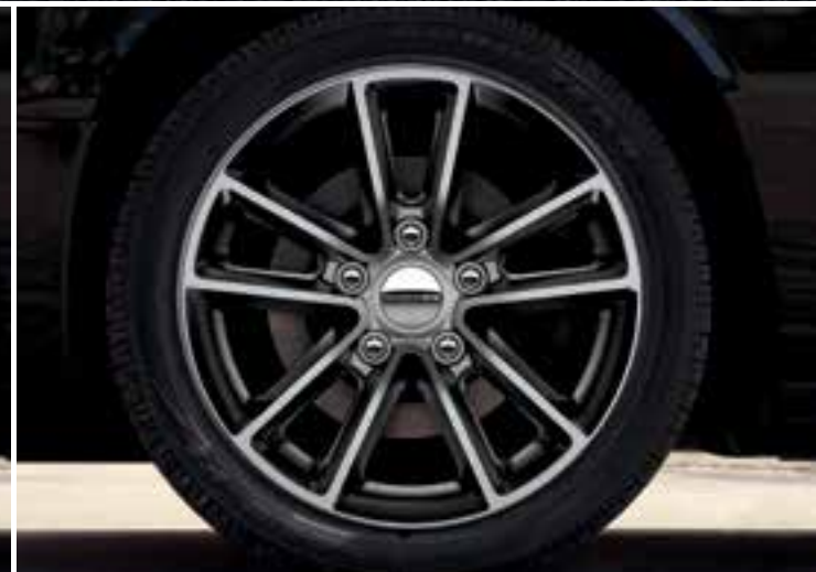
17-inch polished aluminum with Gloss Black pockets (included in Blacktop Package on SE and SXT)