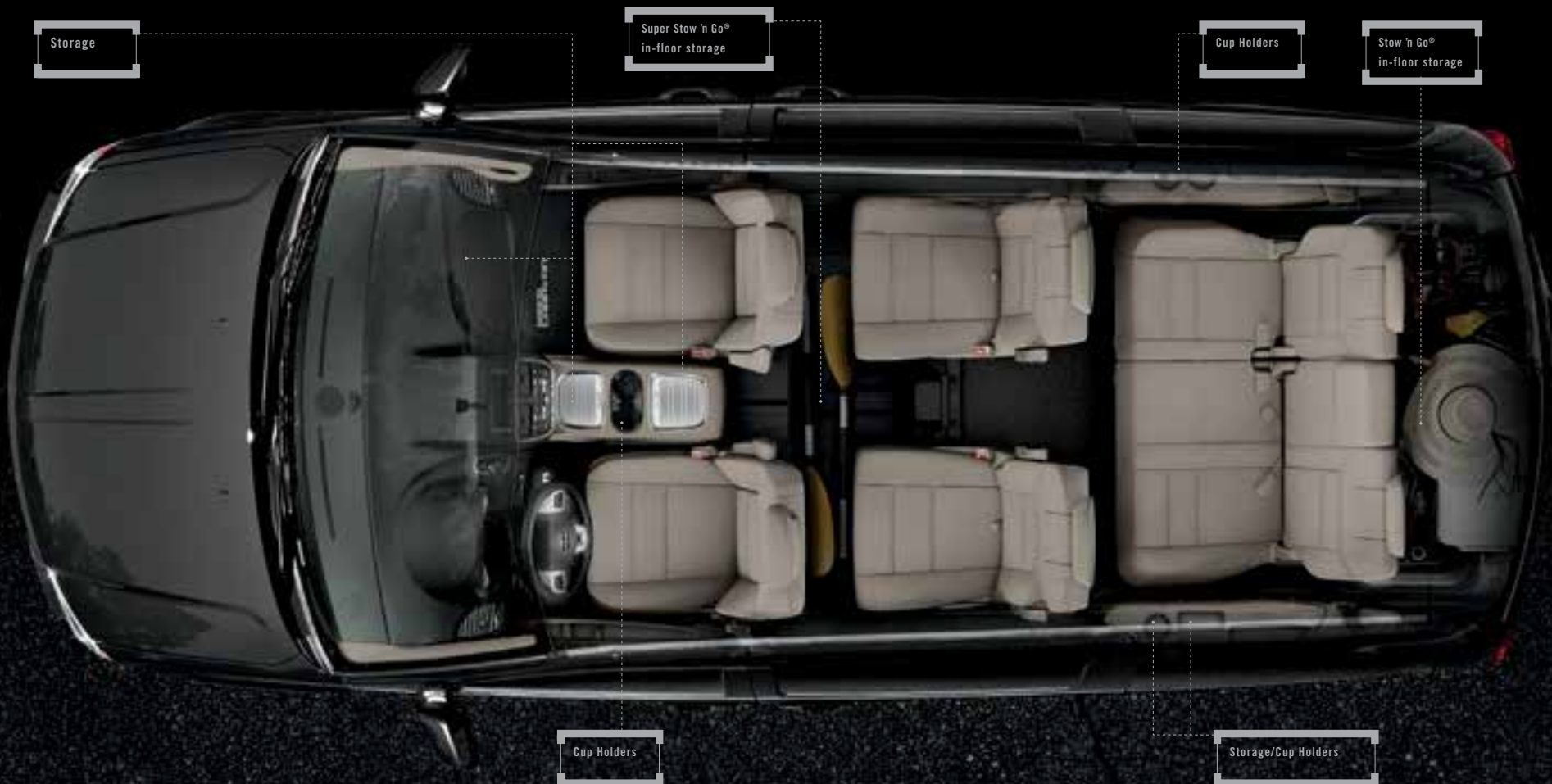
GRAND CARAVAN SXT SHOWN WITH SANDSTORM CLOTH INTERIOR.