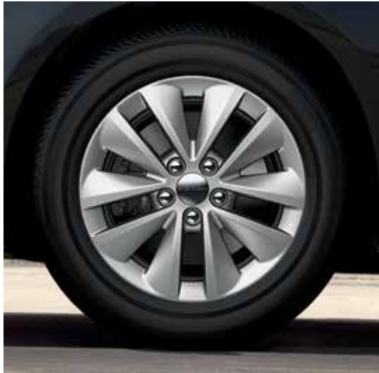
16-inch Tech Silver aluminum (standard on SXT and Aero)