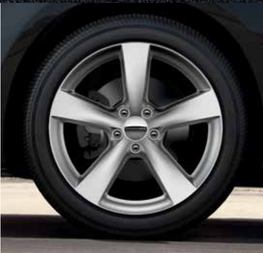
18-inch Satin Silver aluminum (standard on GT)