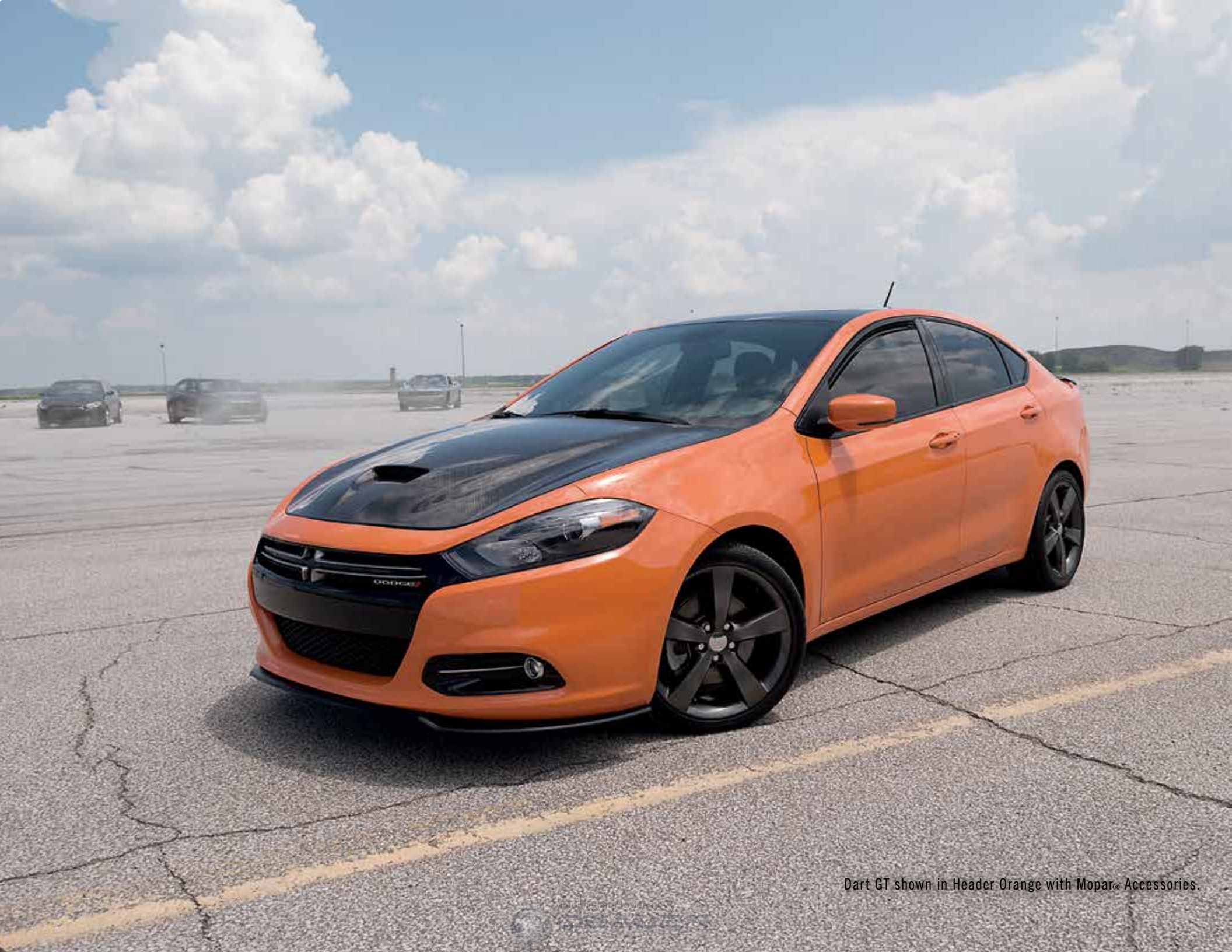
Dart GT shown in Header Orange with Mopar® Accessories.