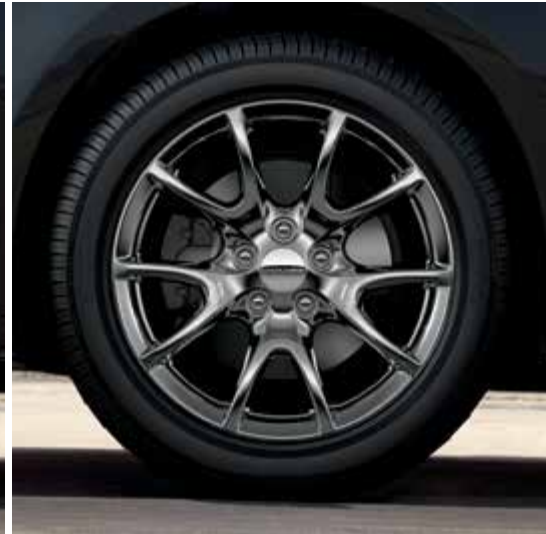
17-inch Hyper Black aluminum (included in Rallye Appearance Group on SXT)