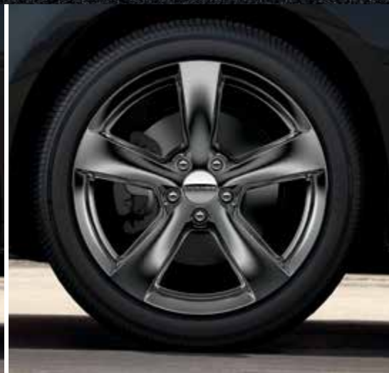
18-inch Hyper Black aluminum (optional on GT)