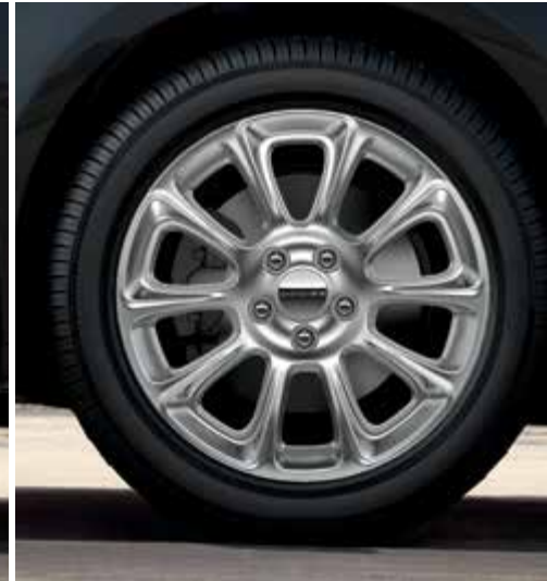
17-inch Satin Silver aluminum (standard on Limited)