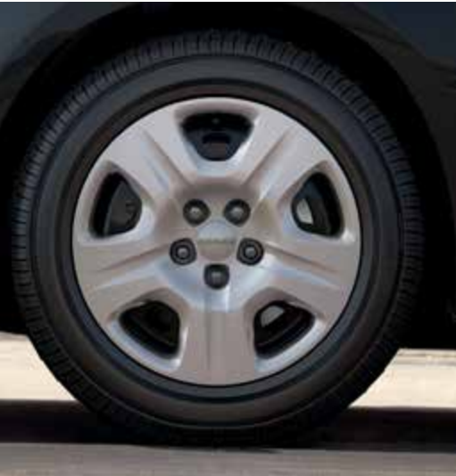
16-inch wheel cover (standard on SE)