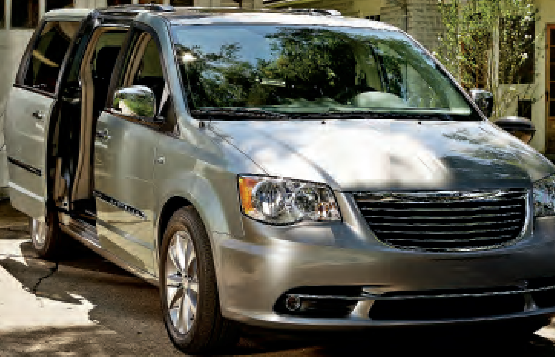
Town & Country 30th Anniversary shown in Billet Silver Metallic.

ONE MOMENT AT A TIME ONE FRIENDSHIP AT A TIME ONE SUCCESS AT A TIME.