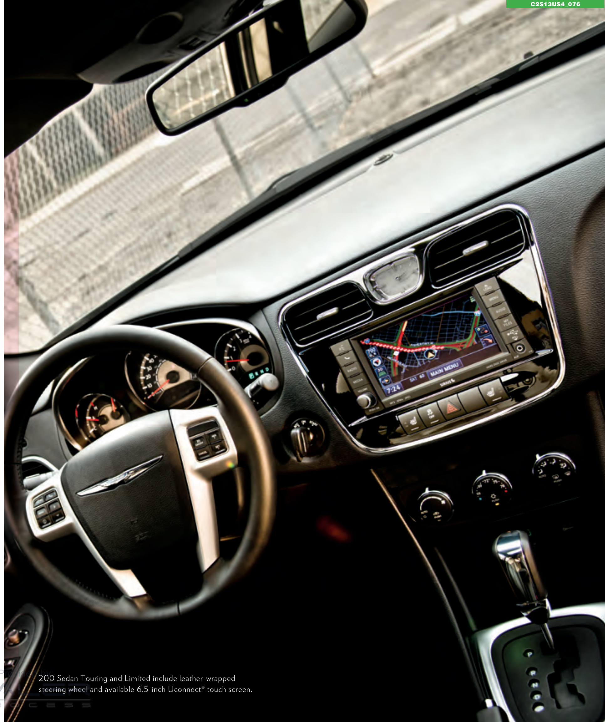
200 Sedan Touring and Limited include leather-wrapped steering wheel and available 6.5-inch Uconnect® touch screen.