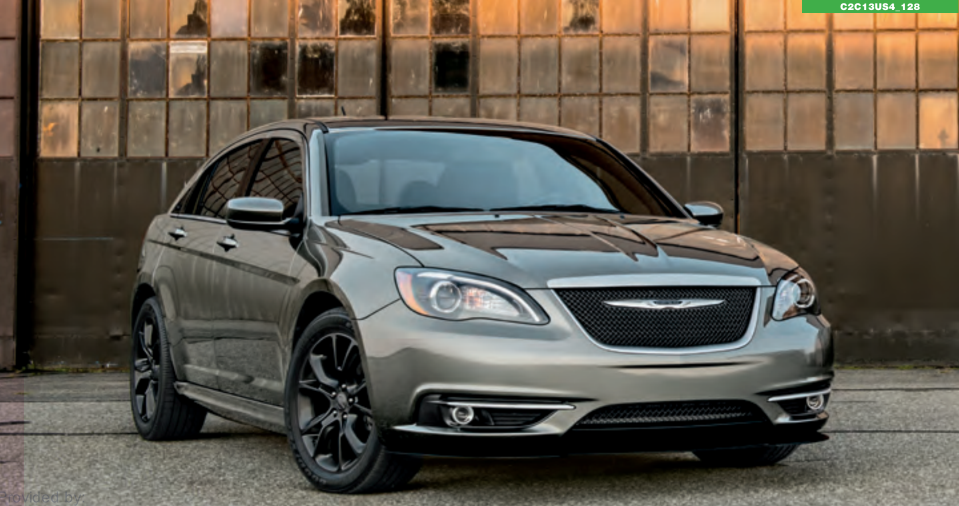
200 Super S Premium interior leather and chrome appointments as well as a unique mesh grille with integrated Chrysler wing design.