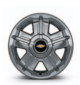
18" Aluminum Wheel ^6