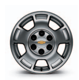
17" Aluminum Wheel with Rectangular Pockets<sup>4,5</sup>