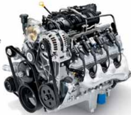
Vortec 5.3L V8

Kick it up a notch. The available Vortec 5.3L V8 engine cranks out a seat-clenching 300 horsepower. And with an EPA estimated 20 MPG highway on 2WD models, this engine offers better highway fuel economy than Dodge Dakota V8?