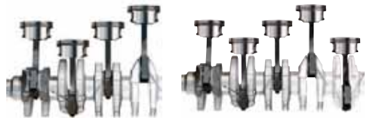
Vortec 2.9L I-4 engine