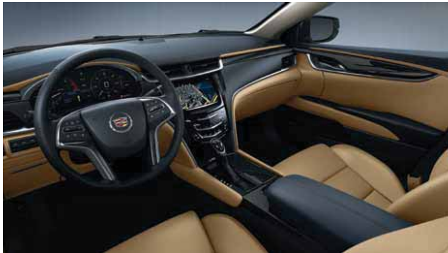
XTS PREMIUM COLLECTION / Caramel with Jet Black accents 3