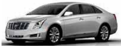
RADIANT SILVER METALLIC