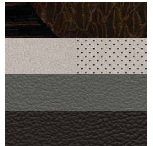
Nutella Sapele with inlay