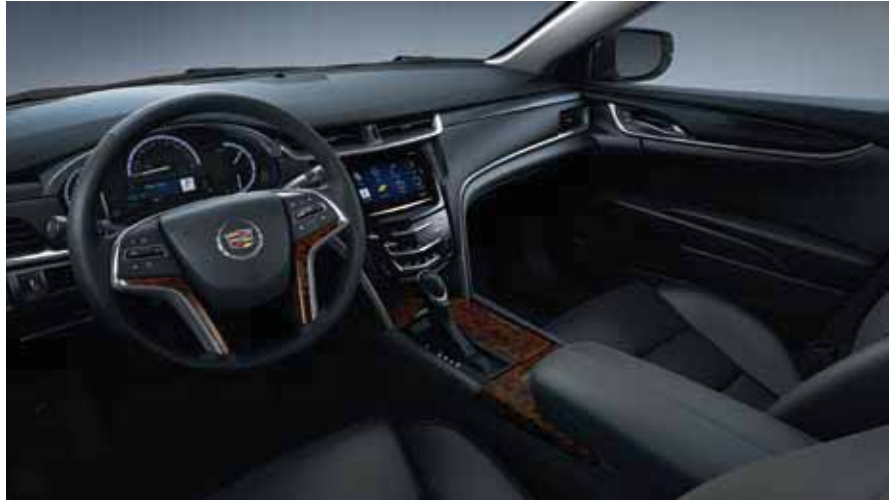
XTS / Jet Black 1