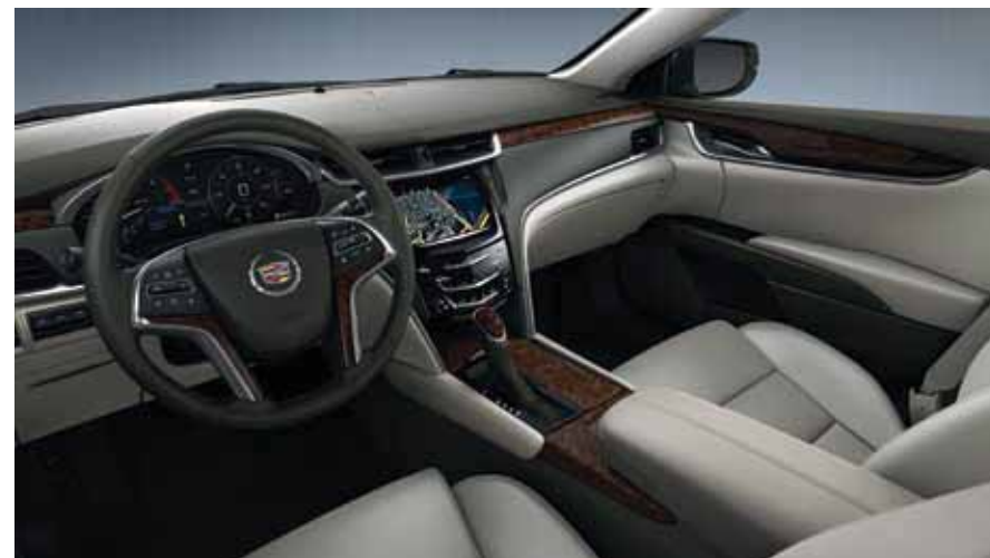
XTS PLATINUM COLLECTION / Light Platinum with Dark Urban and Cocoa accents 5