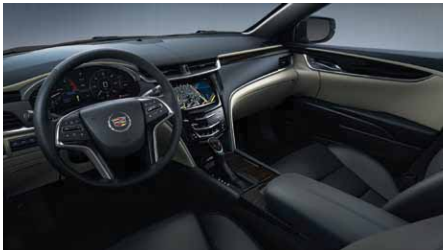
XTS PLATINUM COLLECTION / Jet Black with Light Wheat accents 5