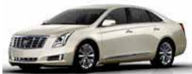
SILVER COAST METALLIC 2,3