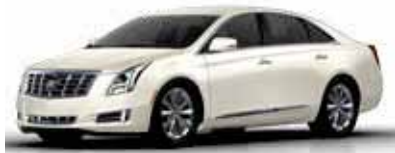
WHITE DIAMOND TRICOAT 1

A meticulous 3-layer process that results in a dramatic hue-shifting color.