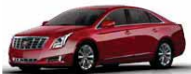
CRYSTAL RED TINTCOAT 1