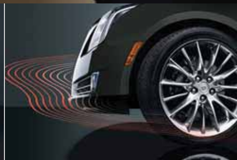
AVAILABLE AUTOMATIC FRONT BRAKING 1