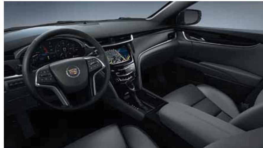
XTS PREMIUM COLLECTION / Medium Titanium with Jet Black accents 4