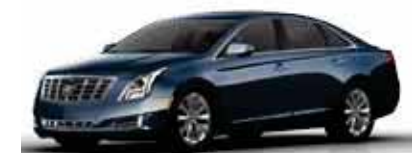
SAPPHIRE BLUE METALLIC 3