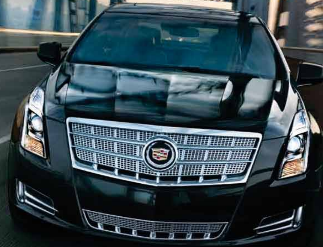
XTS PLATINUM COLLECTION / Graphite Metallic

IT'S A RARE ENGINE THAT APPEALS TO YOUR LEFT BRAIN AND RIGHT FOOT IN EQUAL MEASURES.