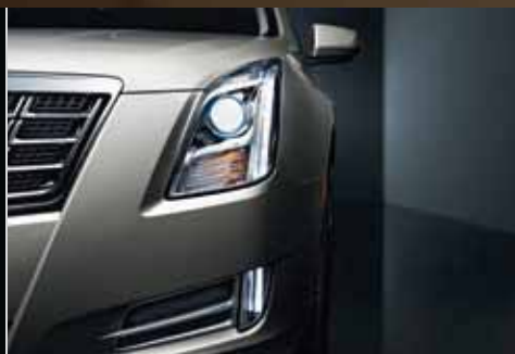
AVAILABLE LED SIGNATURE LIGHTING

The XTS redefines the principles of what's possible, beginning with the groundbreaking CUE. Employing first-of-its-kind technology, CUE brings the intuitive control of smartphones and tablets conveniently to the road. It's so advanced, it even senses your hand as it approaches, displaying relevant information and providing tactile feedback from its brilliant touch screen. The inspired thinking also extends to available XTS safety technologies like its perimeter warning that helps alert you to obstacles and hazards in your path. Under the artfully sculpted hood, the impressive 3.6L direct-injection V6 delivers a refined 304 HP, while available torque-vectoring All-Wheel Drive and the rear electronic Limited-Slip Differential (eLSD) responsively put power where you need it, when you need it. And it's all backed by Cadillac Shield, the most comprehensive suite of owner benefits offered by any luxury automotive brand in the world.