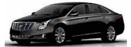
BLACK DIAMOND TRICOAT 1,3