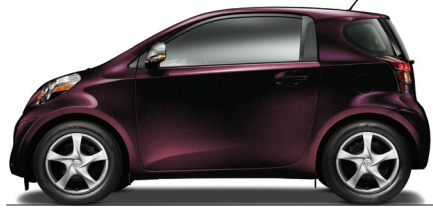
Black Currant Metallic