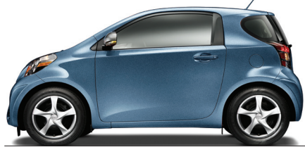
Pacific Blue Metallic