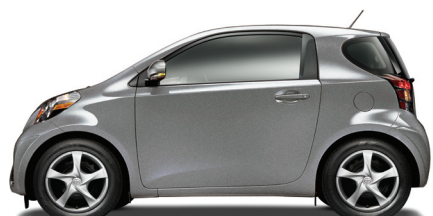
Classic Silver Metallic