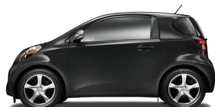
Black Sand Pearl