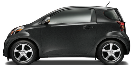
Magnetic Gray Metallic