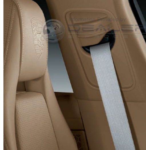
Porsche Crest embossed on front headrests, seat belts in Silver Grey