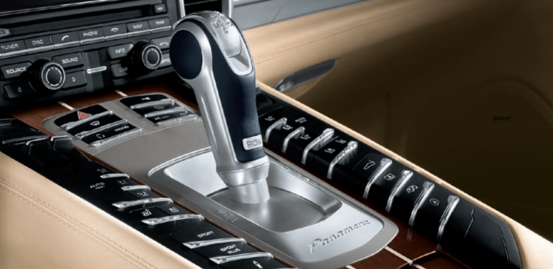
PDK gear selector in aluminium