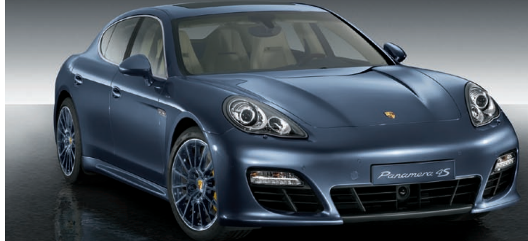
SportDesign package, headlight cleaning system covers painted, 20-inch Panamera Sport wheels painted