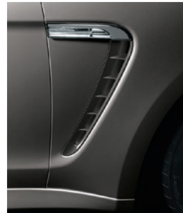
Air vents painted

Find out more about the equipment details of the Panamera S in the current Panamera price list.