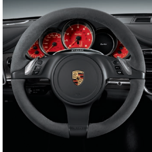
Alcantara steering wheel, padded