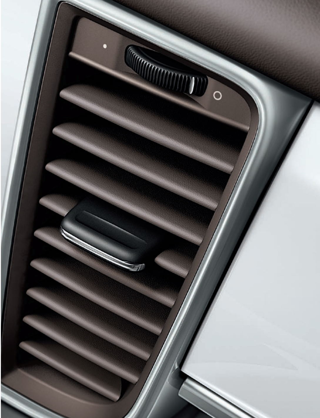
Air vent slats in leather