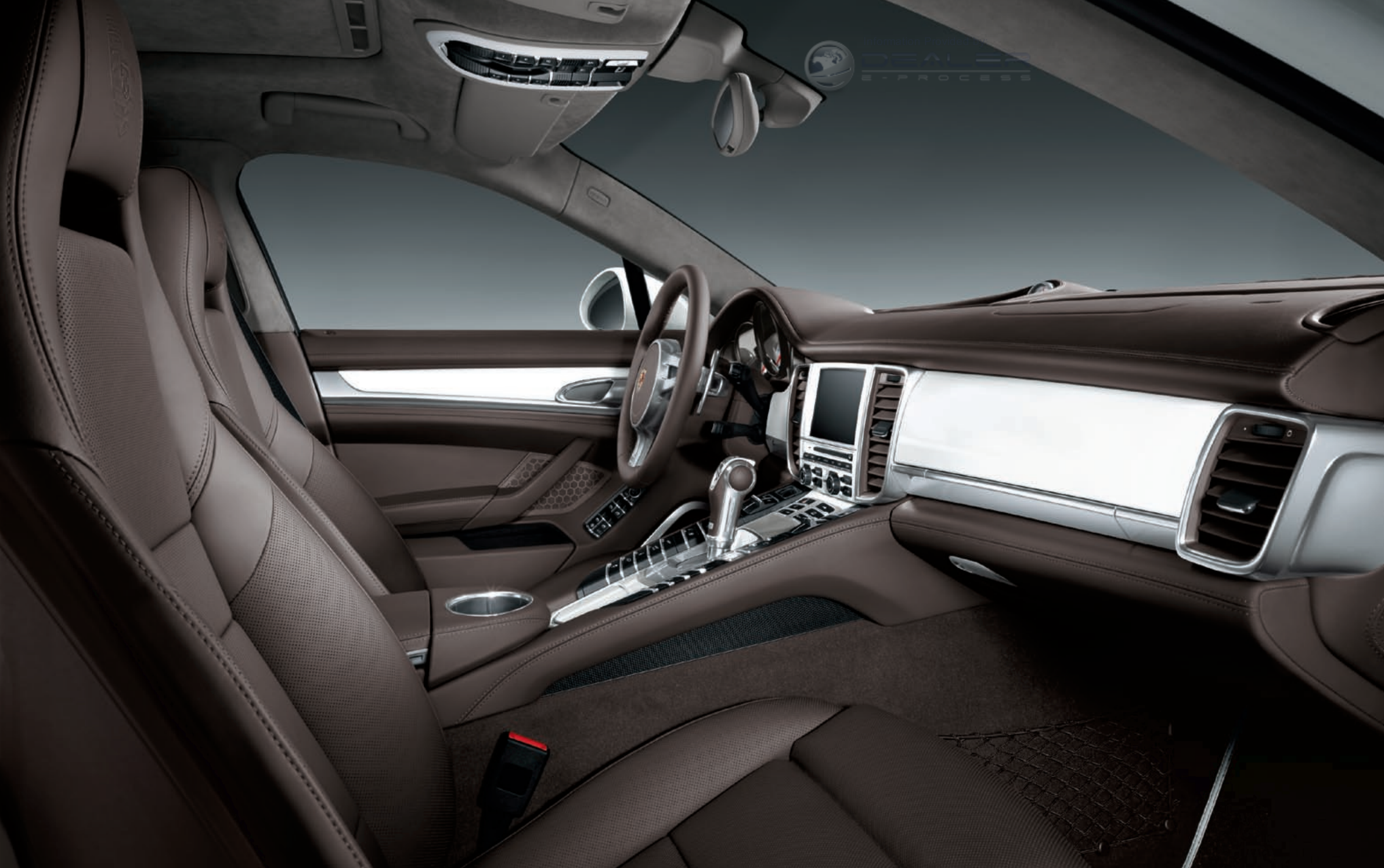
Interior package painted, PCM surround painted, dashboard trim package in leather, dashboard cover in leather, air vent slats in leather, steering wheel column casing and instrument cluster surround in leather, Porsche Crest embossed on front headrests, roofliner grab handles in leather, PDK gear selector in aluminium