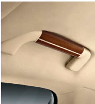
Roofliner grab handles in Yachting Mahogany

Find out more about the equipment details of the Panamera 4S in the current Panamera price list.