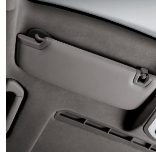
Sun visors in leather