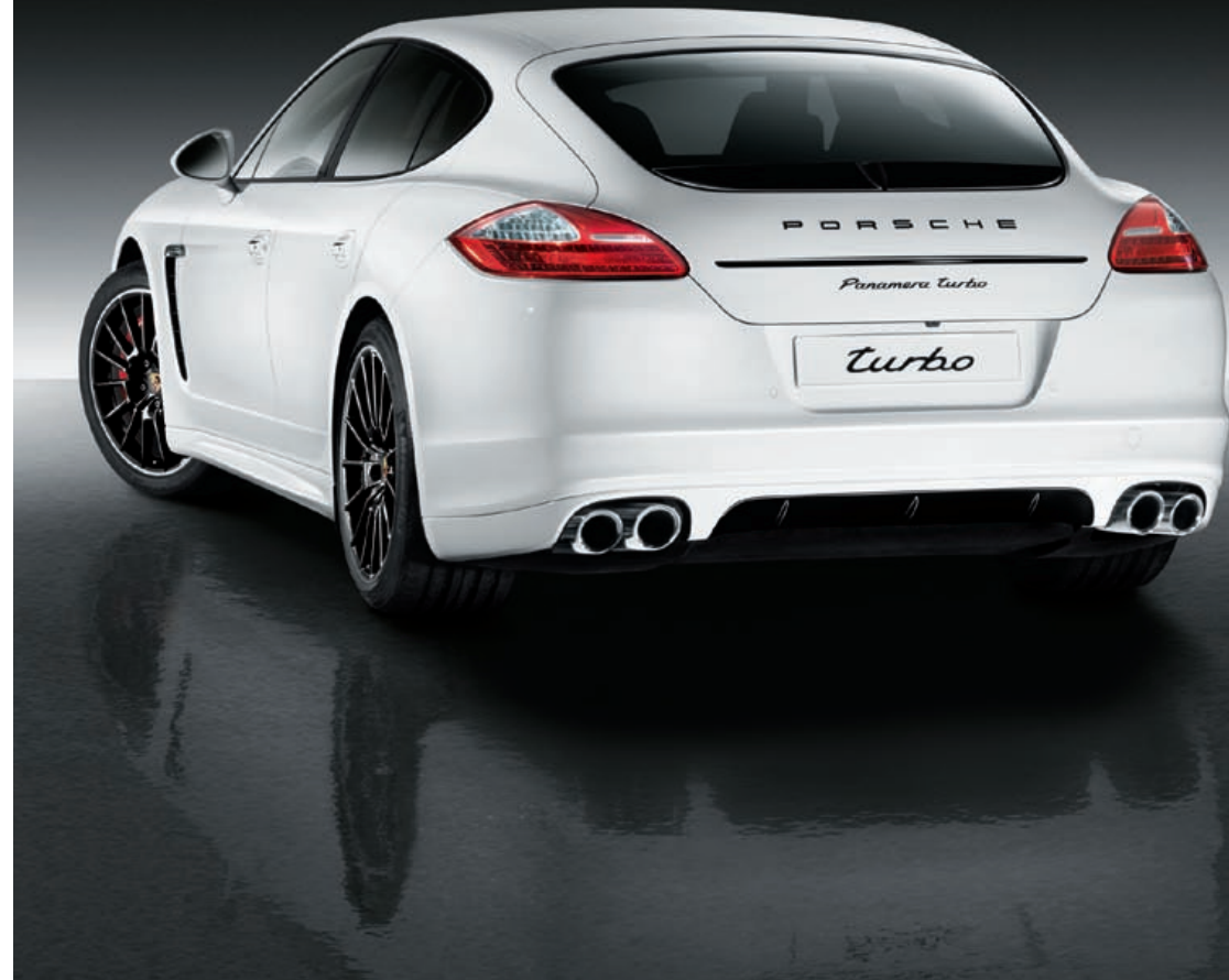
SportDesign package, sports tailpipes, 20-inch Panamera Sport wheels in a black high-gloss finish, Porsche logo and model designation painted