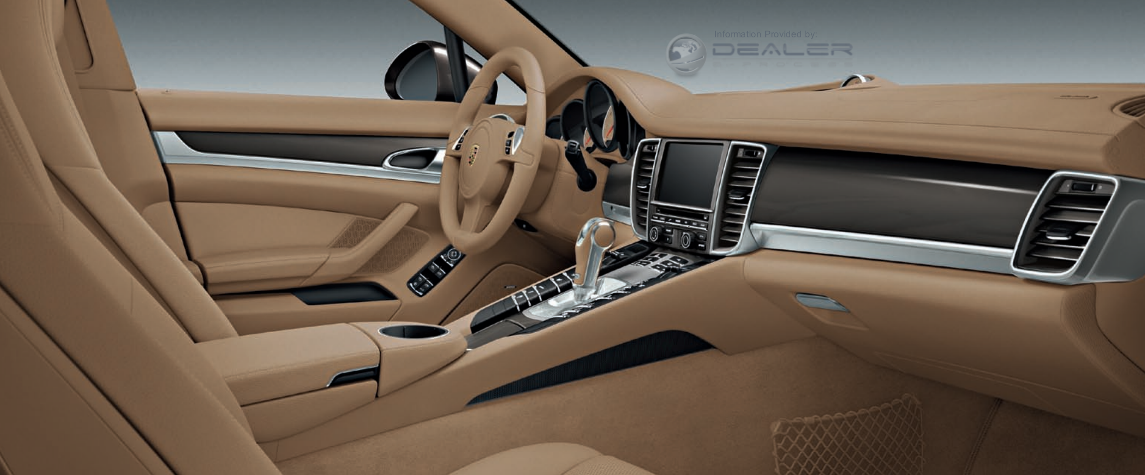
Interior package painted, PCM surround painted, air vent slats painted, instrument dials in Luxor Beige, Sport Chrono stopwatch dial face in Luxor Beige, steering wheel column casing in leather