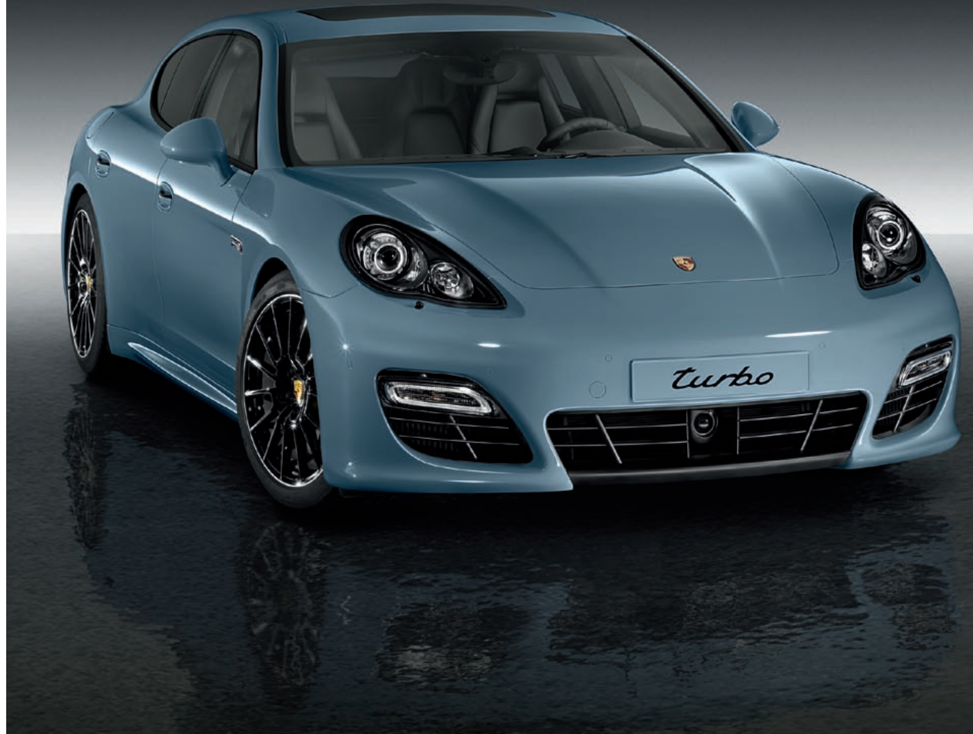
Panamera Turbo with SportDesign package, Bi-Xenon headlamps in black including PDLS, headlight cleaning system covers painted, 20-inch Panamera Sport wheels in a black high-gloss finish