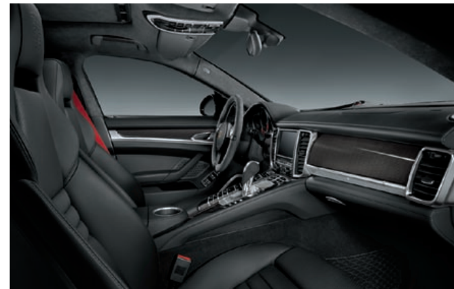
Dashboard trim package in leather, Sport Chrono stopwatch dial face in Guards Red, seat belts in Guards Red

Find out more about the equipment details of the Panamera Turbo in the current Panamera price list.