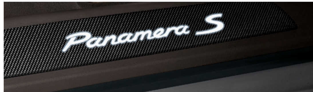
Door sill guards in carbon, illuminated