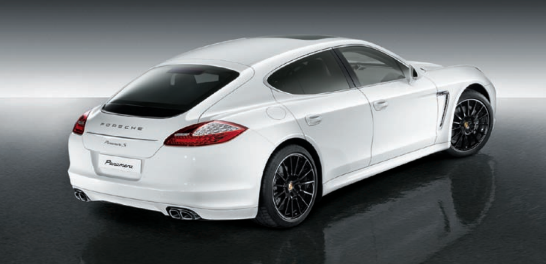
Air vents painted, rear underbody apron painted, diffuser painted, exterior mirror lower trims painted, 20-inch Panamera Sport wheels painted in a black high-gloss finish