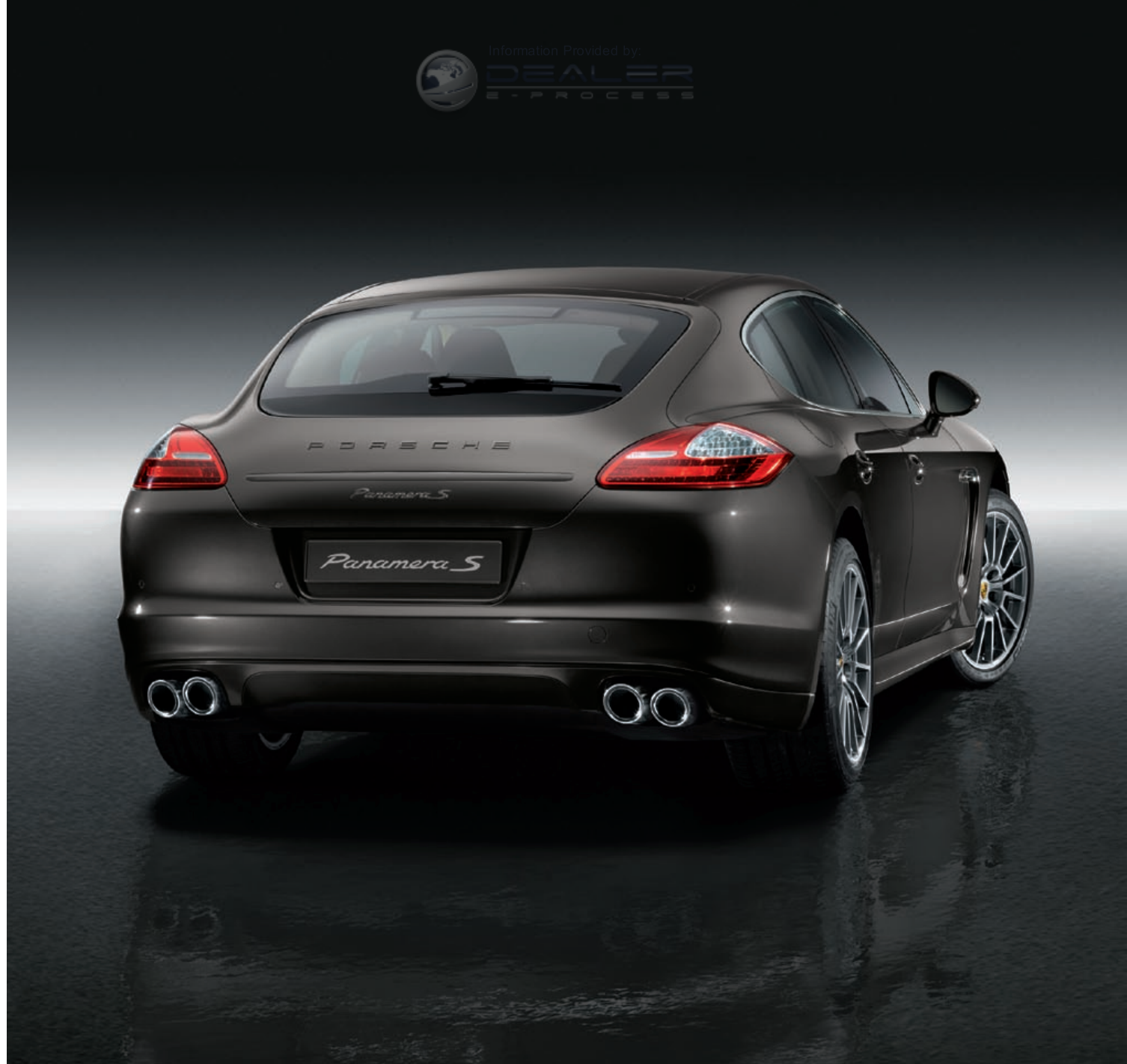
Panamera S with Porsche logo and model designation painted, air vents painted, exterior mirror lower trims painted, rear underbody apron painted, diffuser painted, sports tailpipes, 20-inch Panamera Sport wheels