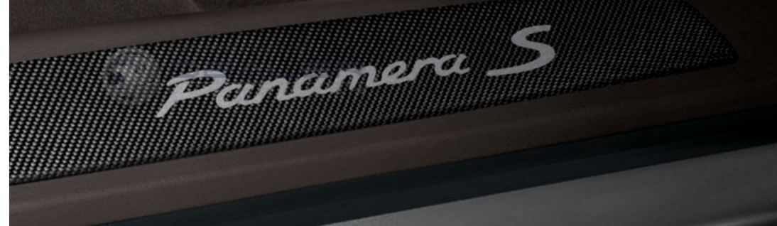
Door sill guards in carbon