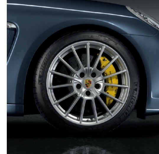
20-inch Panamera Sport wheels