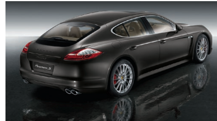
20-inch Panamera Sport wheels, rear underbody apron painted, diffuser painted