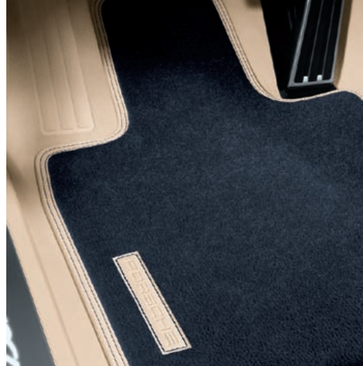
Personalised floor mats with leather edging