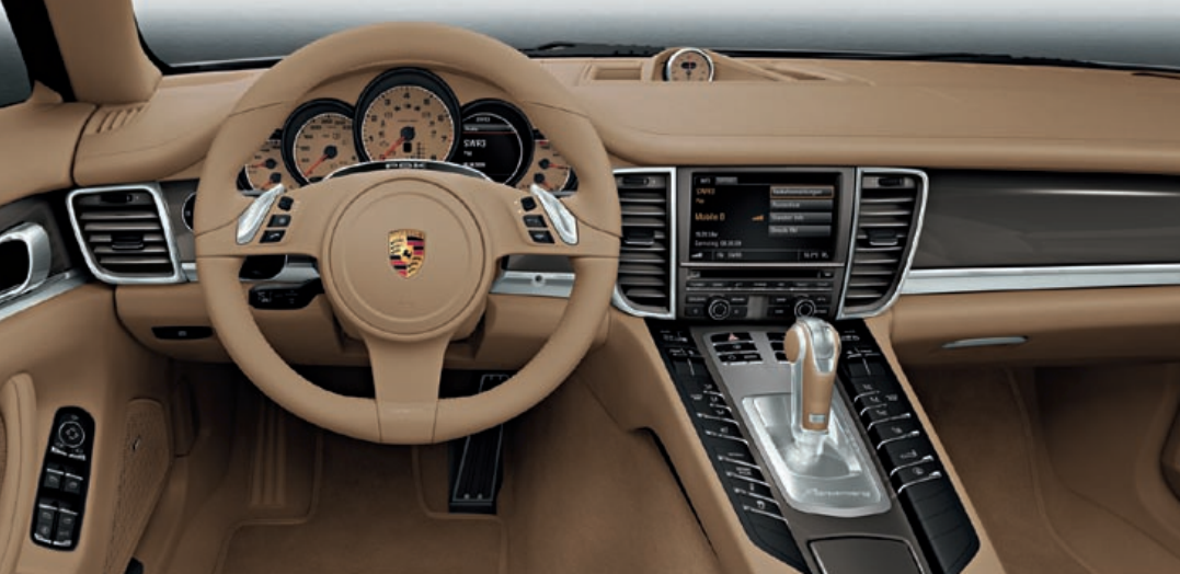
Interior package painted, air vent slats painted, PCM surround painted, instrument dials in Luxor Beige