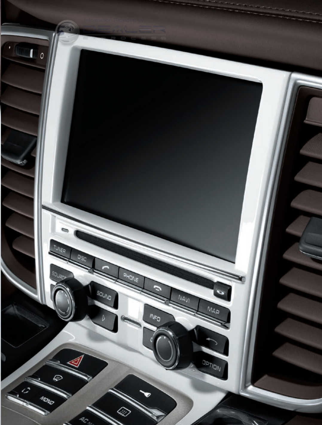
PCM surround painted