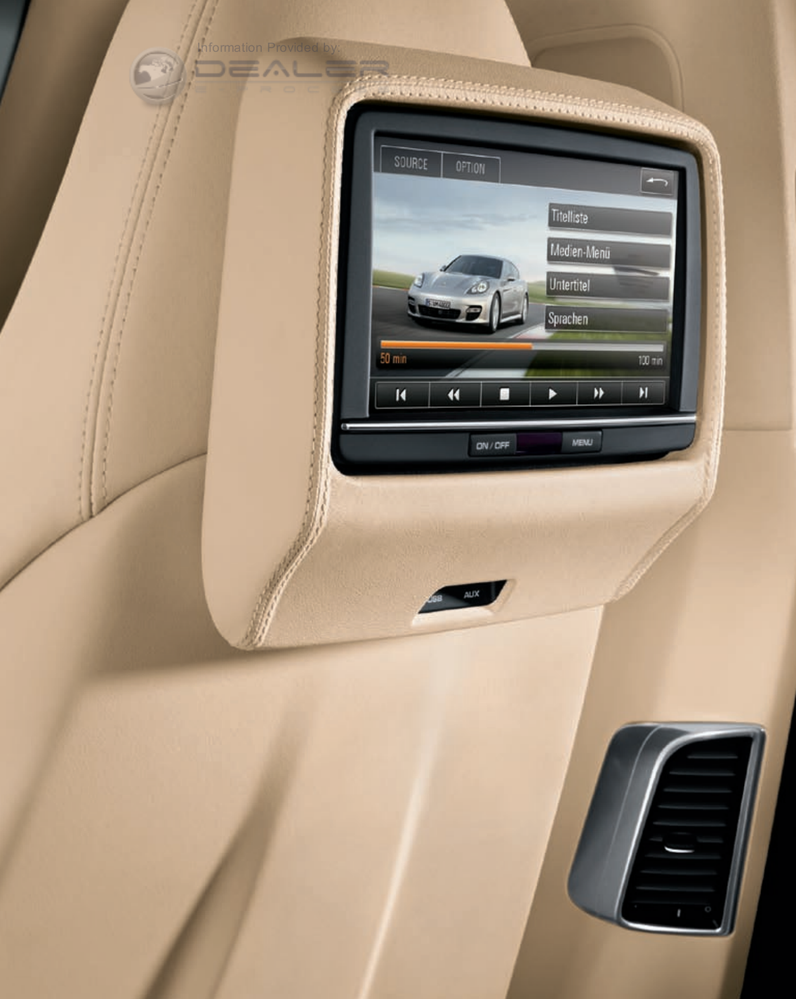
Porsche Rear Seat Entertainment