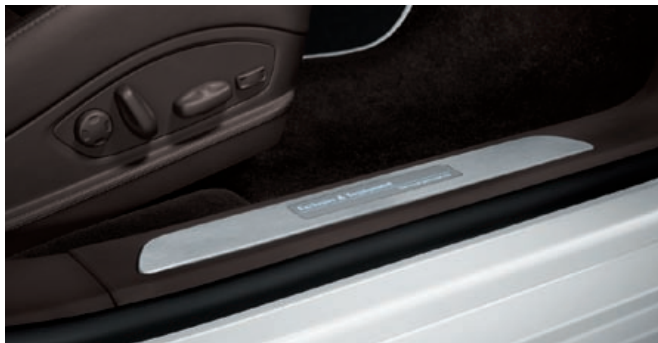
Seat console in leather, inner door sill trim in leather, personalised door sill guards in brushed aluminium, illuminated