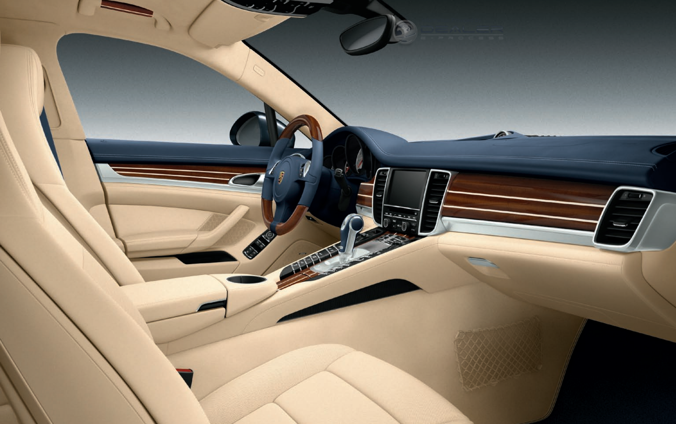
Interior package in Yachting Mahogany, multifunction steering wheel in Yachting Mahogany including steering wheel heating, roofliner grab handles in Yachting Mahogany, sun visors in leather, PDK gear selector in aluminium, personalised floor mats with leather edging