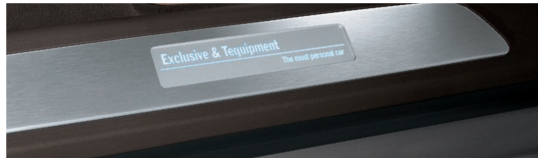
Personalised door sill guards in brushed aluminium, illuminated