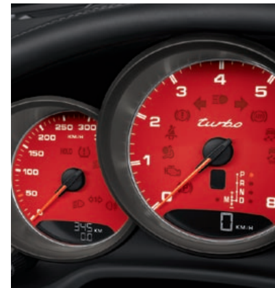
Instrument dials in Guards Red