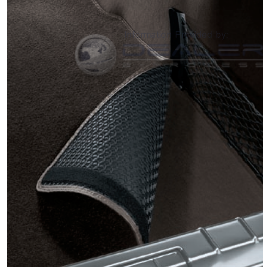
Personalised luggage space mat with leather edging