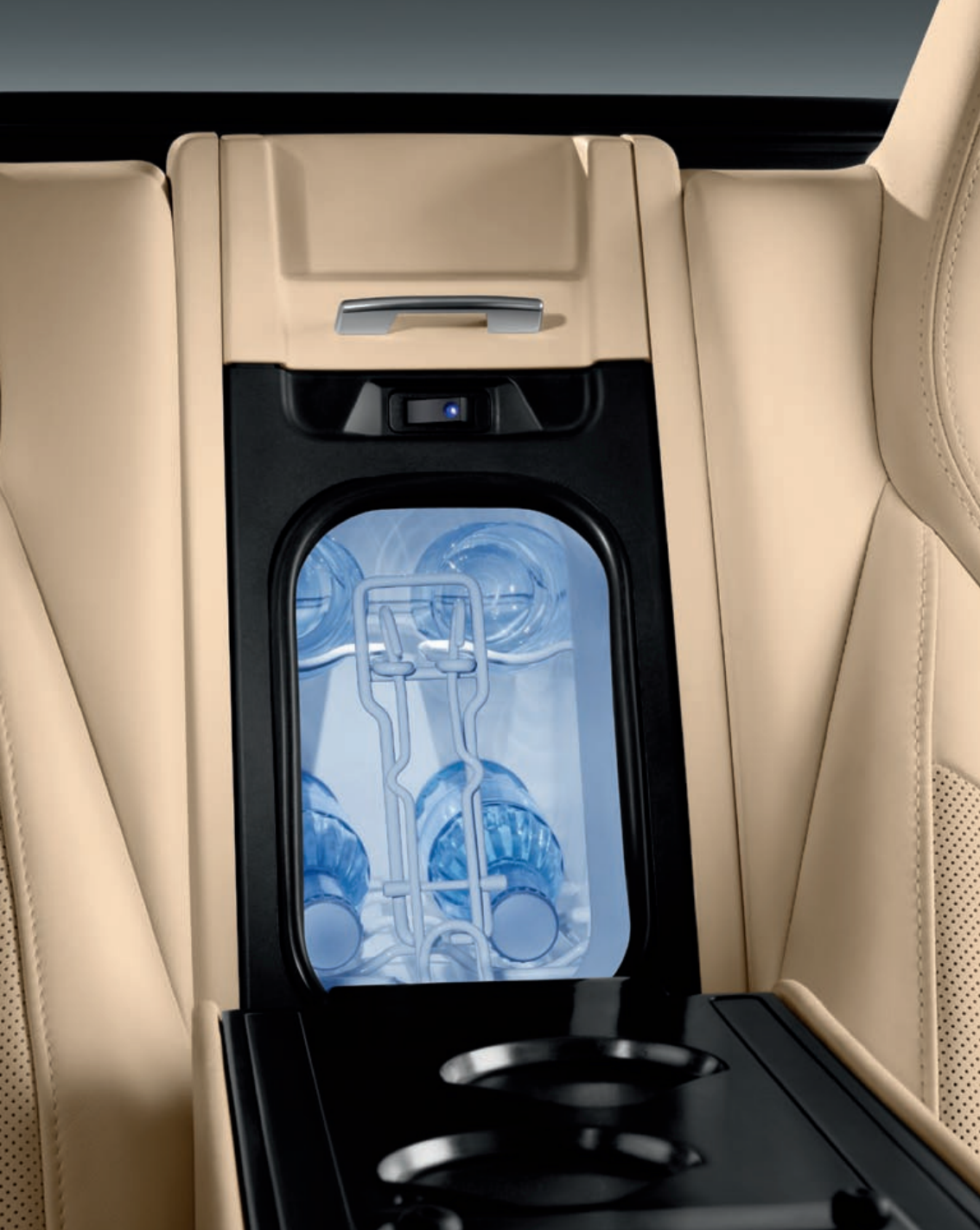
Cooling compartment in rear