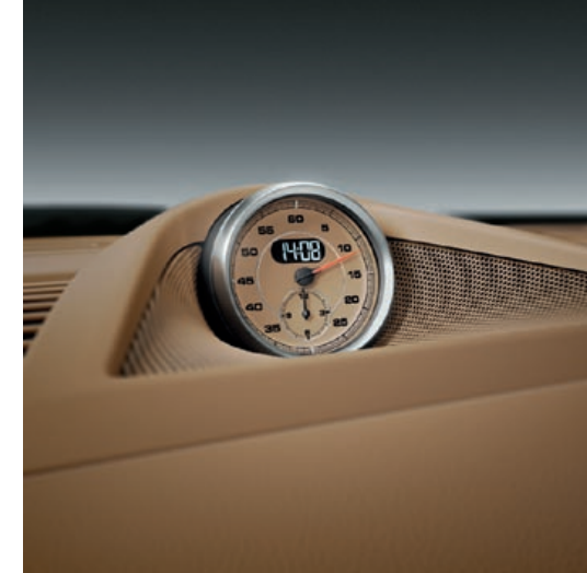
Sport Chrono stopwatch dial face in Luxor Beige