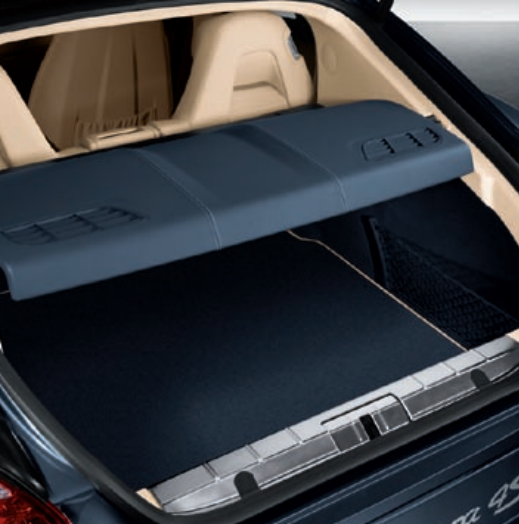
Fixed luggage compartment cover in leather, personalised luggage space mat with leather edging