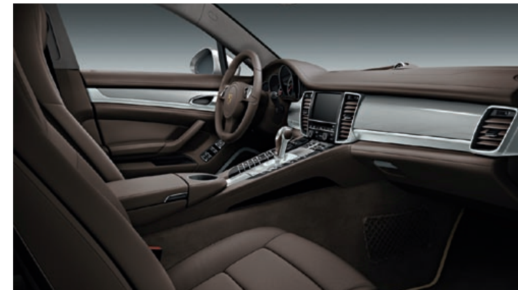
Interior package painted, PDK gear selector in aluminium, air vent slats in leather