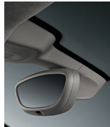
Rear-view mirror in leather

Find out more about the equipment details of the Panamera Turbo in the current Panamera price list.