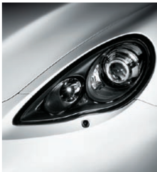
Bi-Xenon headlights in black including PDLs

Find out more about the equipment details of the Panamera Turbo in the current Panamera price list.