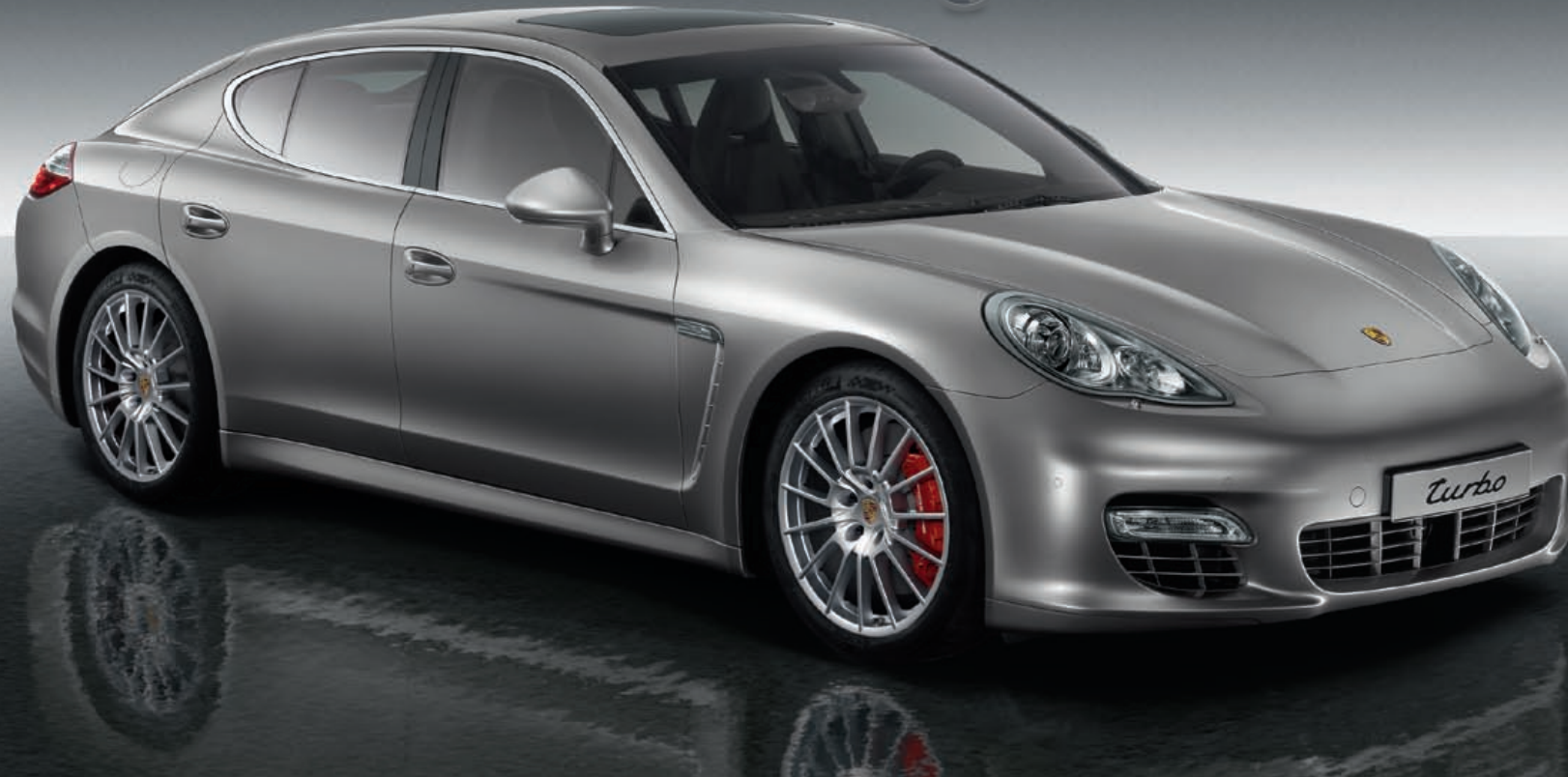
Headlight cleaning system covers painted, air intake grilles painted, air vents painted, 20-inch Panamera Sport wheels