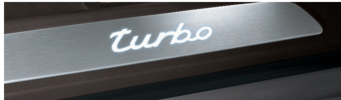
Door sill guards in brushed aluminium, illuminated