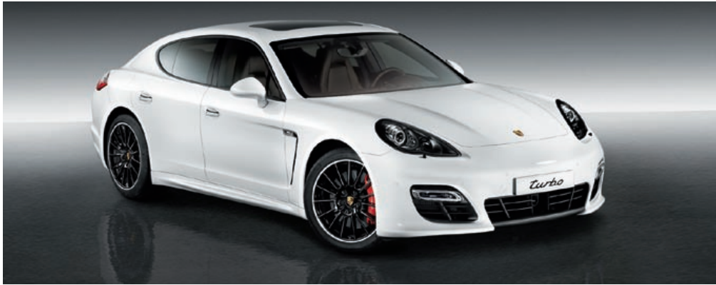
SportDesign package, 20-inch Panamera Sport wheels in a black high-gloss finish, Bi-Xenon headlights in black including PDLs, exterior mirror lower trims painted