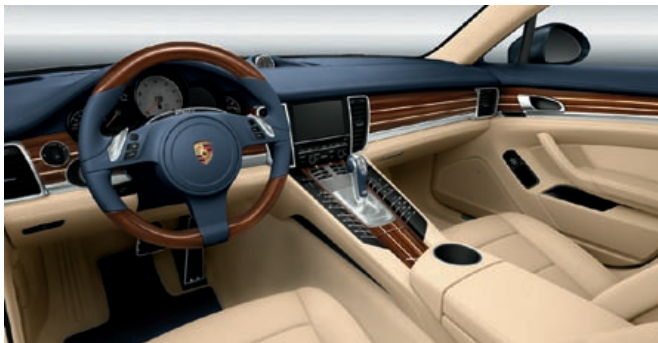
Interior package in Yachting Mahogany, multifunction steering wheel in Yachting Mahogany including steering wheel heating