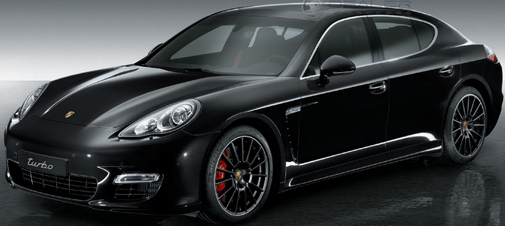
20-inch Panamera Sport wheels painted in a black high-gloss finish, headlight cleaning system covers painted, air intake grilles painted, air vents painted, exterior mirror lower trims painted