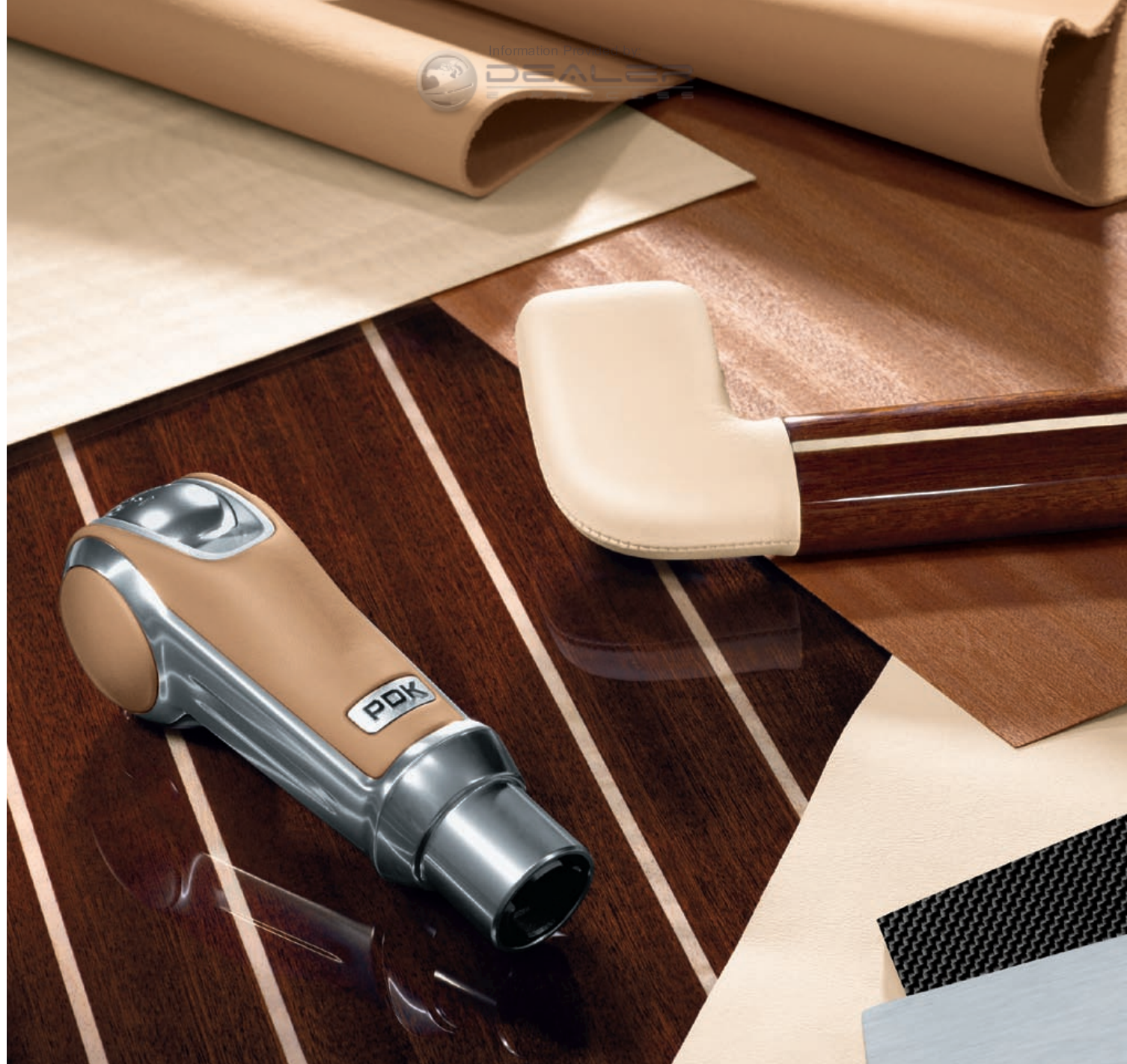
Material composition: Yachting Mahogany, leather, carbon and aluminium

So whether you would like to personalise the interior and exterior of your car, add a SportDesign package or Powerkit, your wish is our command.