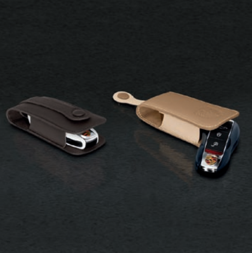
Vehicle key painted, key pouch in leather