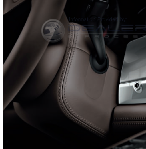
Steering wheel column casing in leather