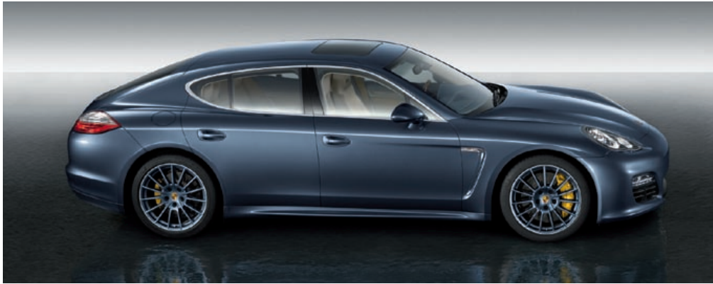
SportDesign package, 20-inch Panamera Sport wheels painted