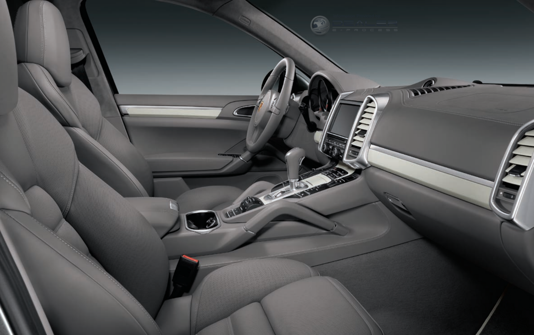
Interior package in leather, air vent slats in leather, steering column casing in leather, personalised floor mats with leather edging