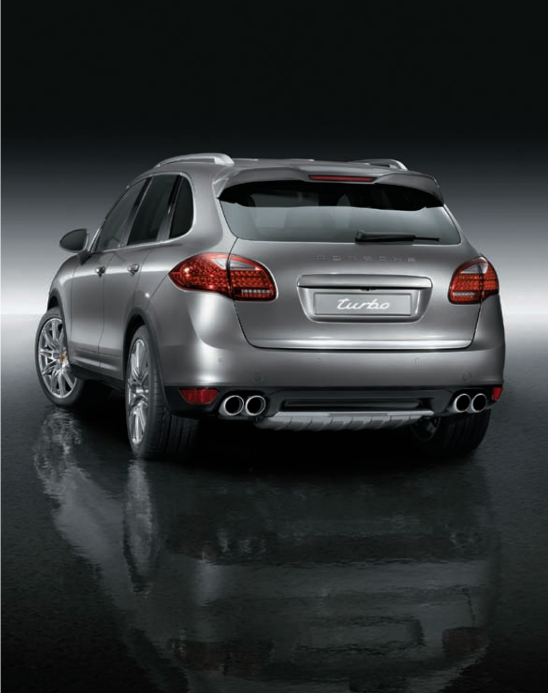
Exterior mirrors painted, 21-inch Cayenne SportEdition wheels with wheel arch extensions, roof spoiler separation edge painted, Porsche logo painted