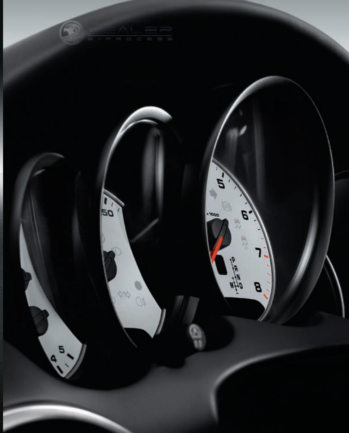
Instrument dials in white