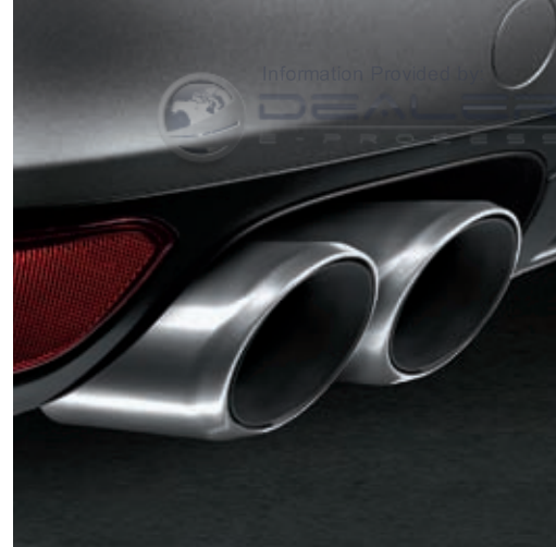
Sports exhaust system