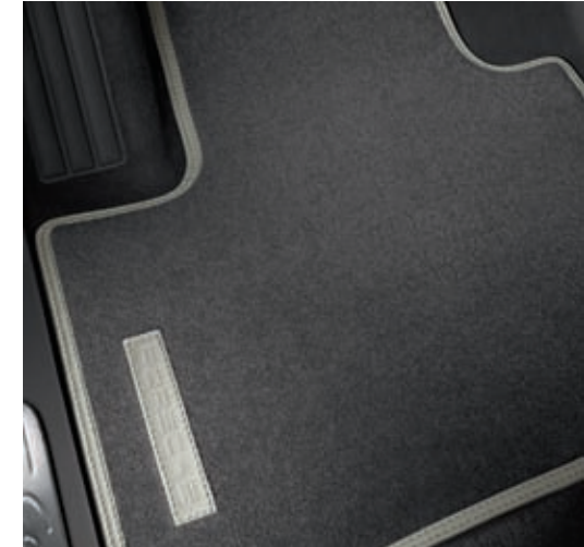
Personalised floor mats with leather edging