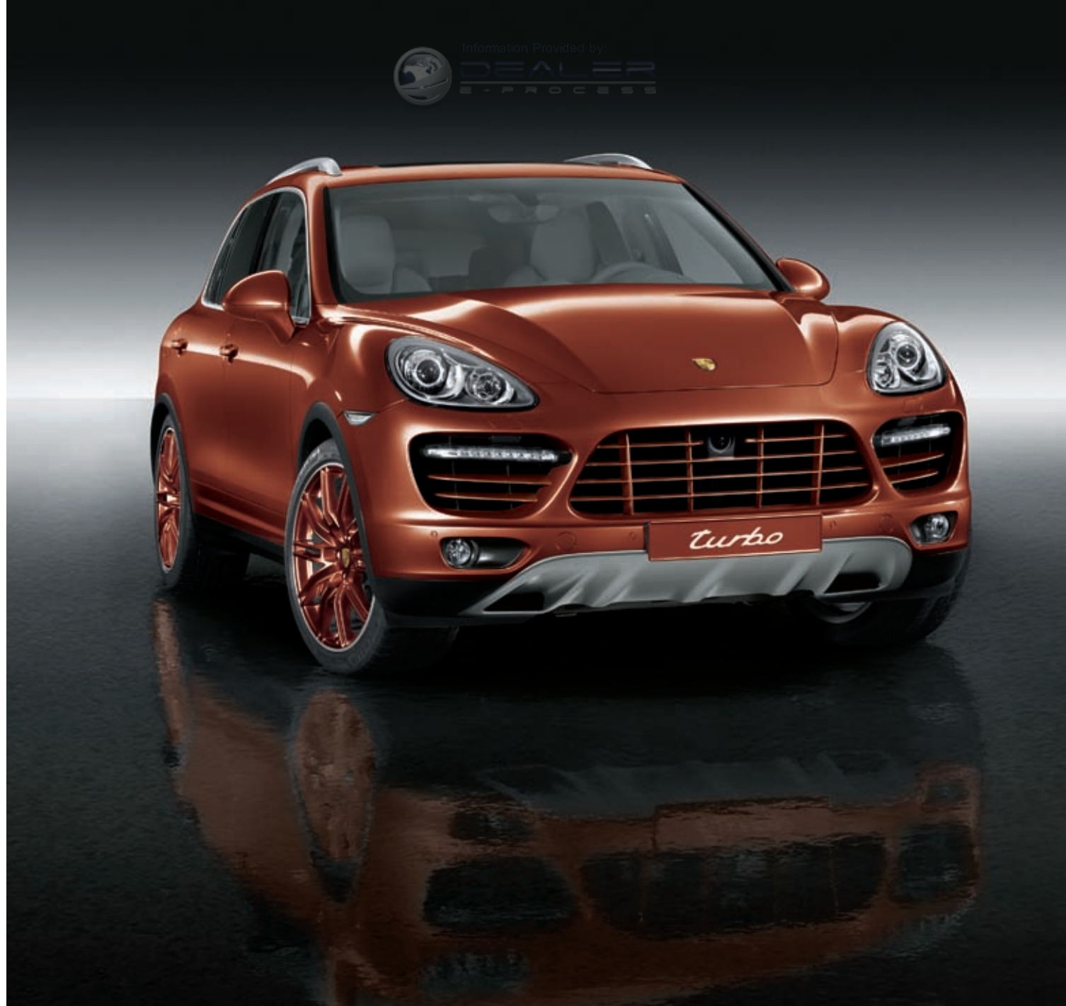
Cayenne Turbo with air intake grilles painted, exterior mirrors painted, 21-inch Cayenne SportEdition wheels painted with wheel arch extensions