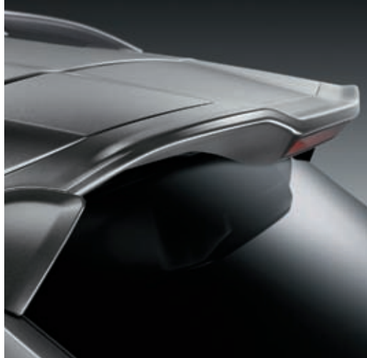
Roof spoiler separation edge painted