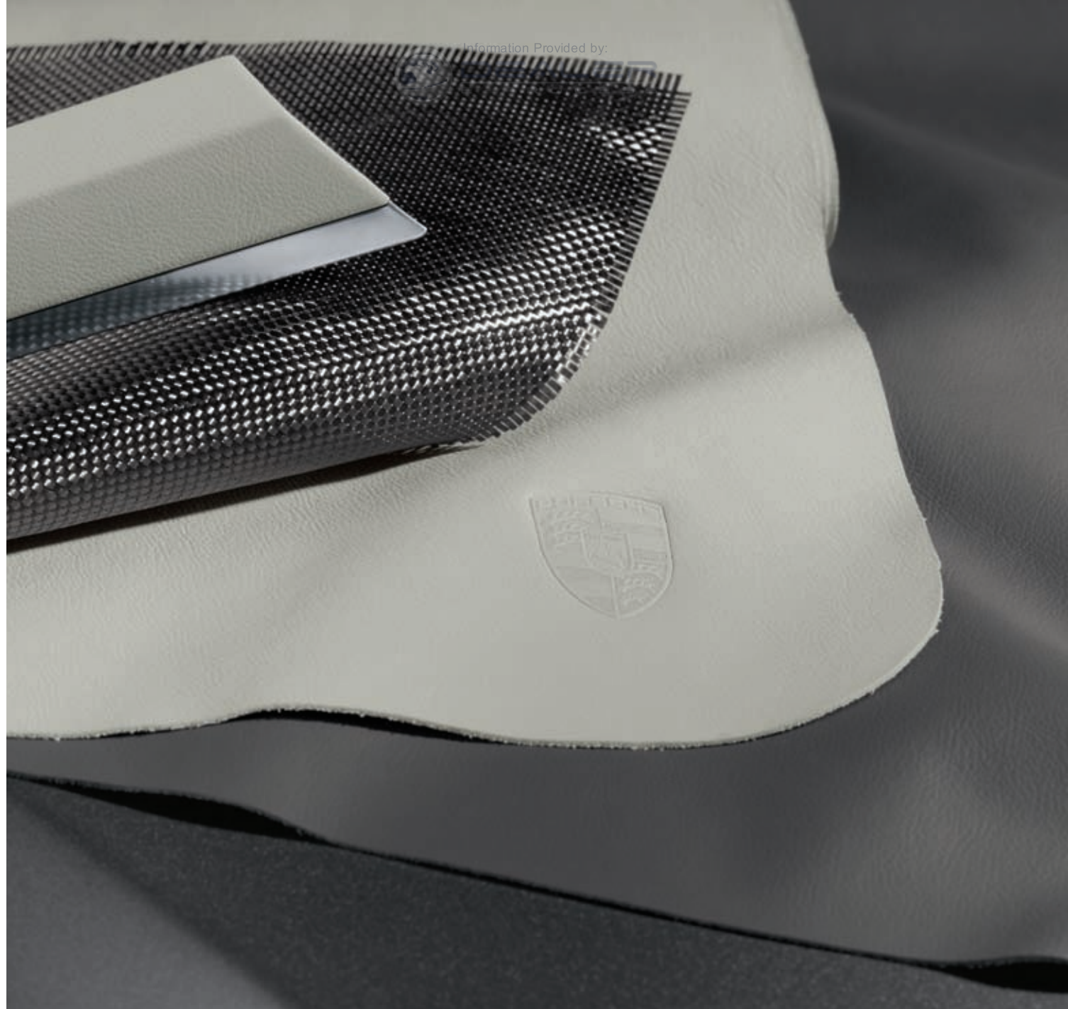
Material composition: leather, carbon and painted exterior finish

Personalised refinements to the interior and exterior are not the only options we offer. If you would like to make your Cayenne a little sportier, for example with the sports exhaust system, you can rest assured that your Porsche is in good hands.