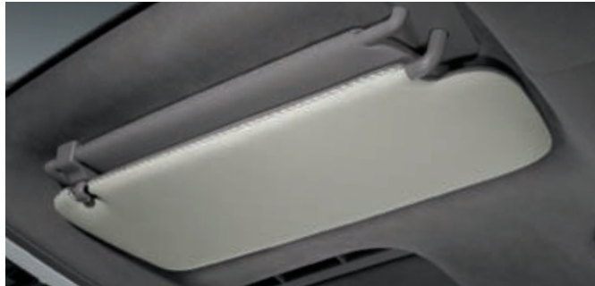
Sun visors in leather