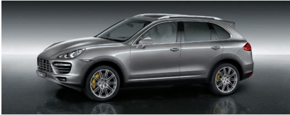
Air intake grilles painted, exterior mirrors painted, 21-inch Cayenne SportEdition wheels with wheel arch extensions, roof spoiler separation edge painted