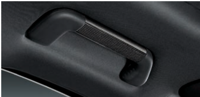
Roofliner grab handles in carbon