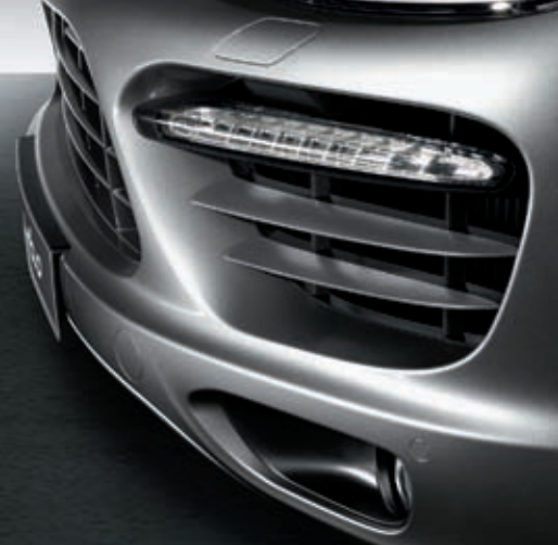
Air intake grilles painted