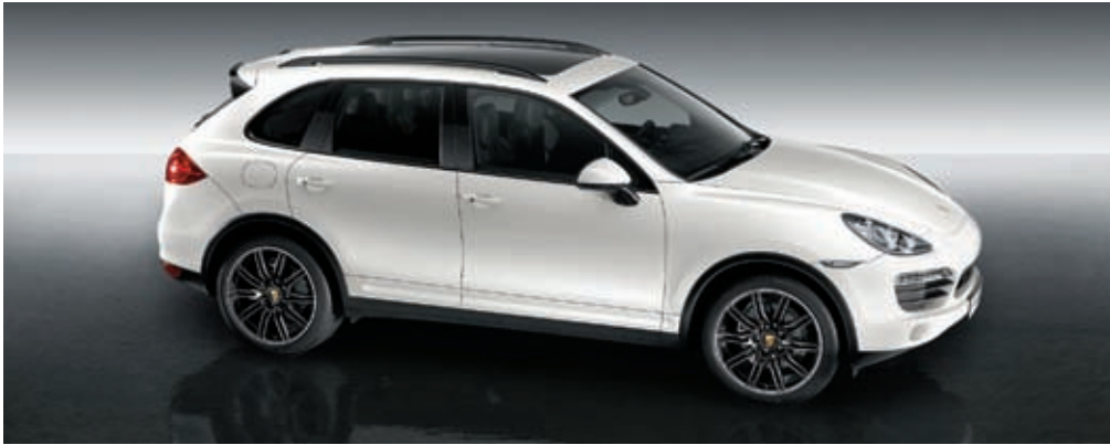
Extended exterior package painted in a black high-gloss finish, 21-inch Cayenne SportEdition wheels painted in a black high-gloss finish with wheel arch extensions