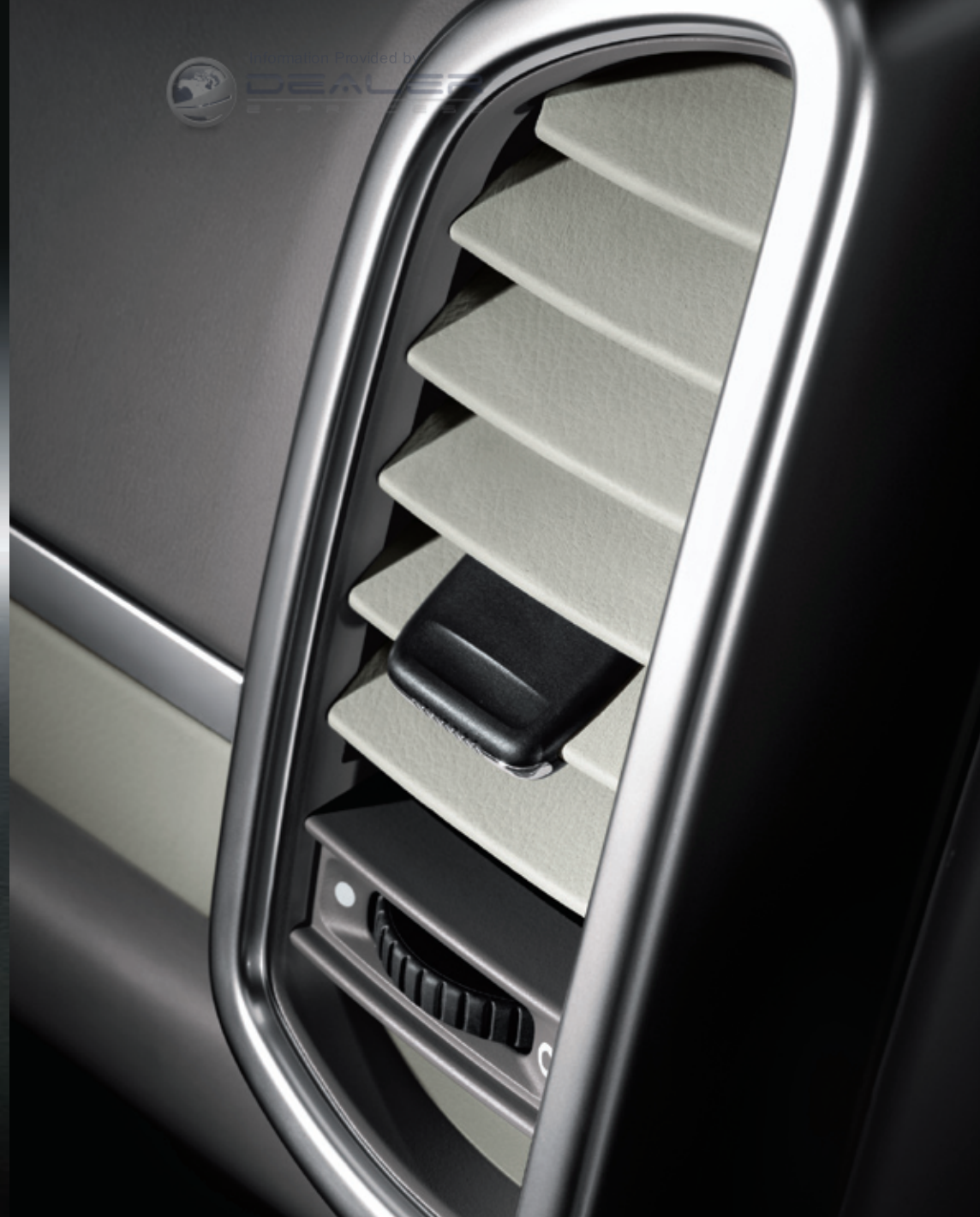
Air vent slats in leather