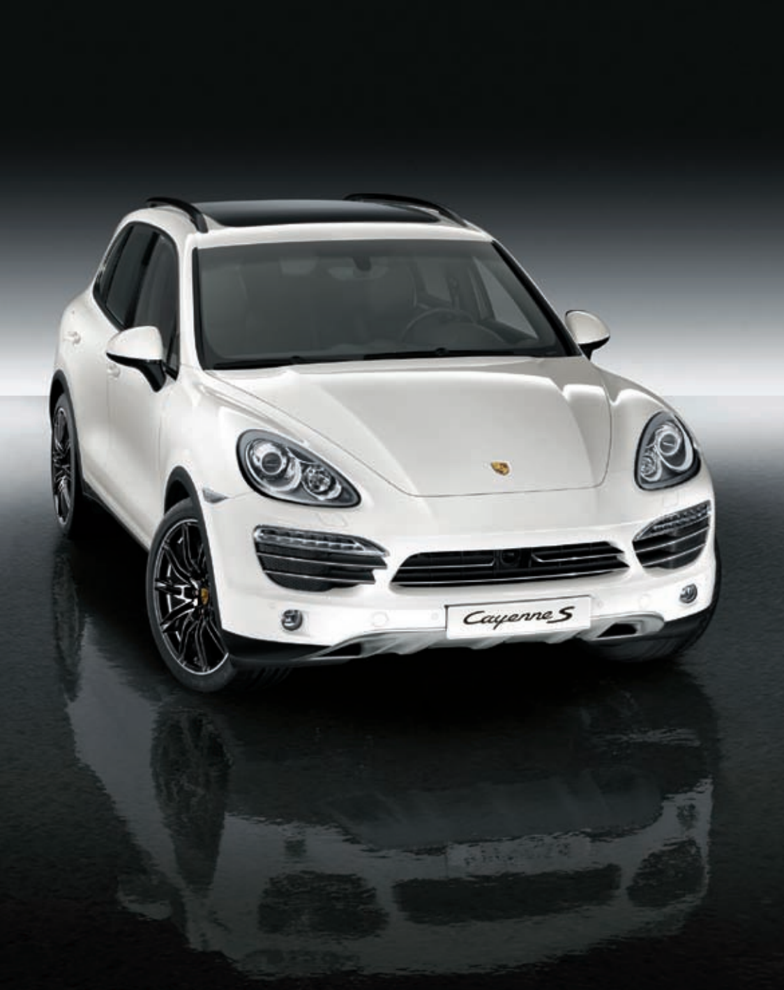
Extended exterior package painted in a black high-gloss finish, 21-inch Cayenne SportEdition wheels painted in a black high-gloss finish with wheel arch extensions