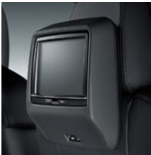
Porsche Rear Seat Entertainment

Excellent dynamics, agility, lots of space and room for your own interpretation of 'sport'. With the exterior add-on package painted black and the interior package with a Sand White painted finish, the Cayenne S in Sand White may just be an example, but it's an example par excellence. Find out more about the equipment details of the Cayenne S in Sand White in the current Cayenne price list.