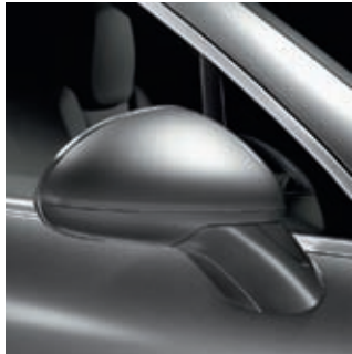
Exterior mirrors painted

Find out more about the equipment details of the Cayenne Turbo in Meteor Grey Metallic in the current Cayenne price list.