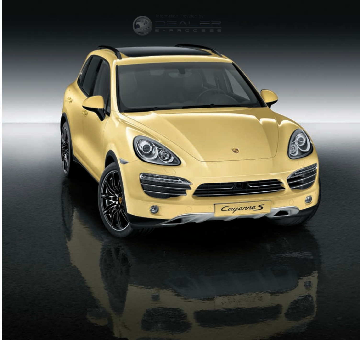
Cayenne S with extended exterior package painted in a black high-gloss finish, 21-inch Cayenne SportEdition wheels painted in a black high-gloss finish with wheel arch extensions