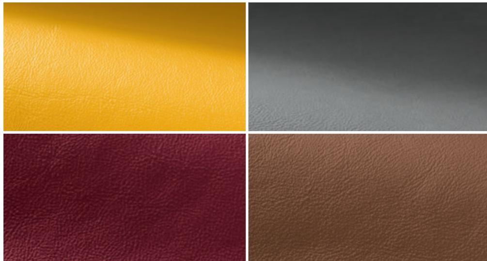
Selection of leather colours: Speed Yellow, Steel Grey, Flamenco Red, Havana

In addition to leather, we offer fine woods 1) and carbon to enhance the interior. You can find out what is possible at your Porsche Centre. Or contact the Porsche Exclusive Customer Centre in Zuffenhausen directly for an individual consultation (see page 28).