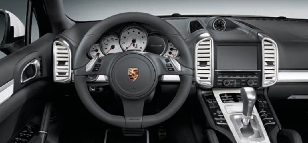
Interior package painted, air vent slats painted, instrument dials in white