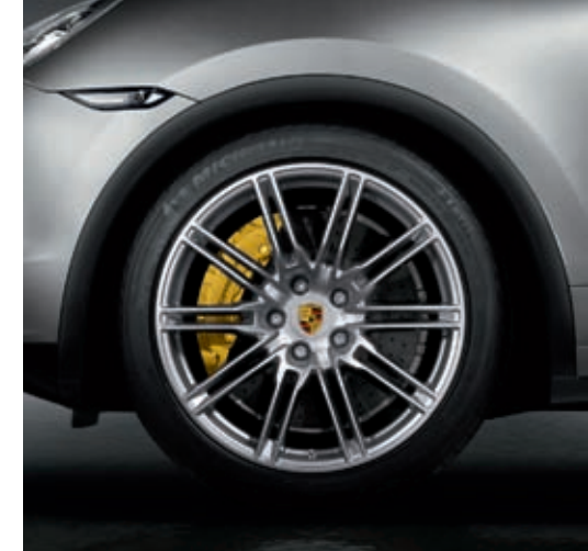
21-inch Cayenne SportEdition wheel with wheel arch extensions