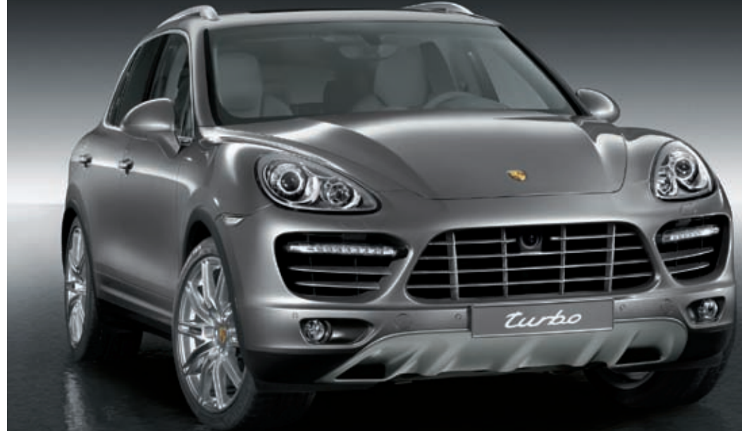
Air intake grilles painted, exterior mirrors painted, 21-inch Cayenne SportEdition wheels with wheel arch extensions