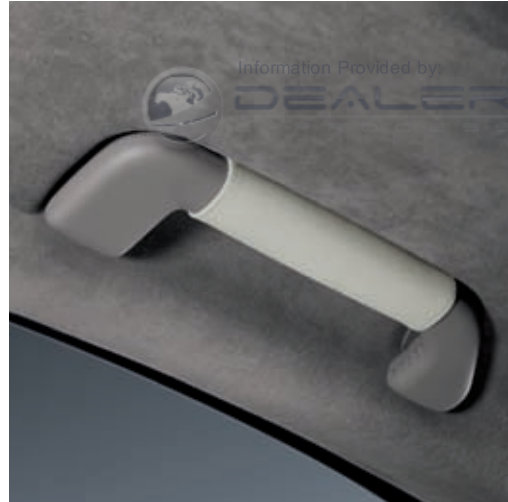
Roofliner grab handles in leather