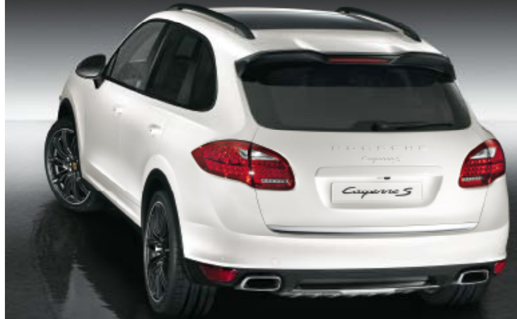
Paint: Exclusive Black (optional), signature Porsche of mass-gloss black, inside - Cayenne SportEdition - 21 inches painted on the (optional) with the roof of the