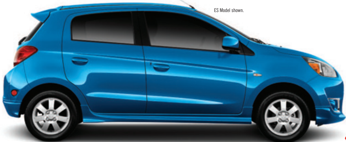
ES Model shown.

Other standard features include an Automatic Climate Control system, power windows with driver's side auto up/down; power sideview mirrors; a convenient 60/40 split folding rear seat; keyless entry; a sporty rear spoiler and a four-speaker 140-watt CD/MP3 audio system with USB/iPod ® input. 3 Options include a new MMES Navigation System, Bluetooth ® hands-free phone system, 4 a One-Touch Start-Stop engine switch, a FAST-Key entry system and much more. But the best feature of the all-new 2014 Mitsubishi Mirage is the sheer fun you'll enjoy just driving it.