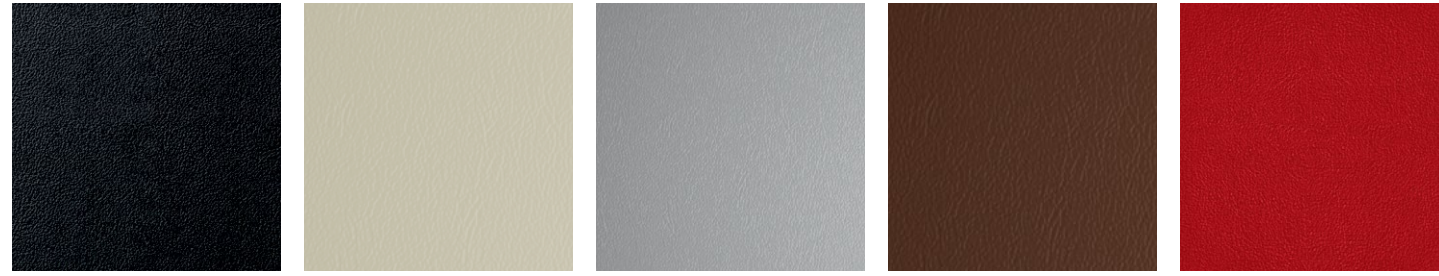
BLACK LEATHER or SEMI-ANILINE LEATHER* ALABASTER LEATHER LIGHT GRAY SEMI-ANILINE LEATHER* SADDLE SEMI-ANILINE LEATHER* RED SEMI-ANILINE LEATHER*