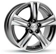
18-in five-spoke alloy wheels 2 with Liquid Graphite finish Available