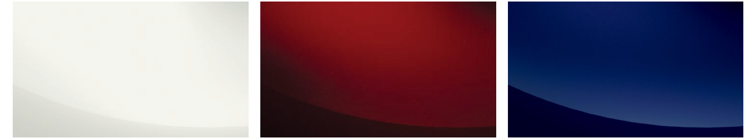
STARFIRE PEARL MATADOR RED MICA DEEP SEA MICA