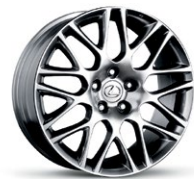
18-in G-Spider alloy wheels 2 Available

For more info, visit lexus.com/ISC/wheels