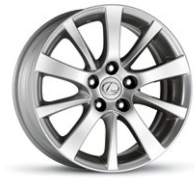
17-in 10-spoke alloy wheels 2 Standard