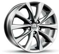
18-in split-five-spoke alloy wheels 2 Available