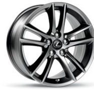
18-in split-five-spoke alloy wheels 2 with Dark Graphite finish Standard IS C F SPORT